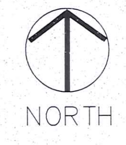
LOCATION PLAN 1/1250 @ A1