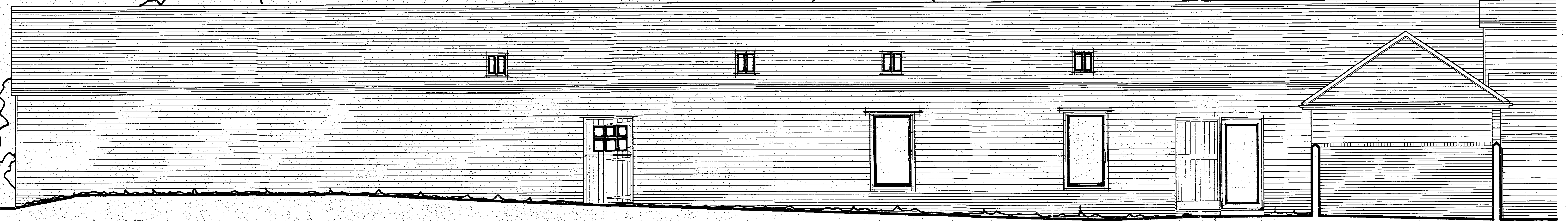
REAR ELEVATION (NORTH EAST)