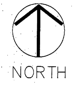
SITE PLAN 1/200 © A1