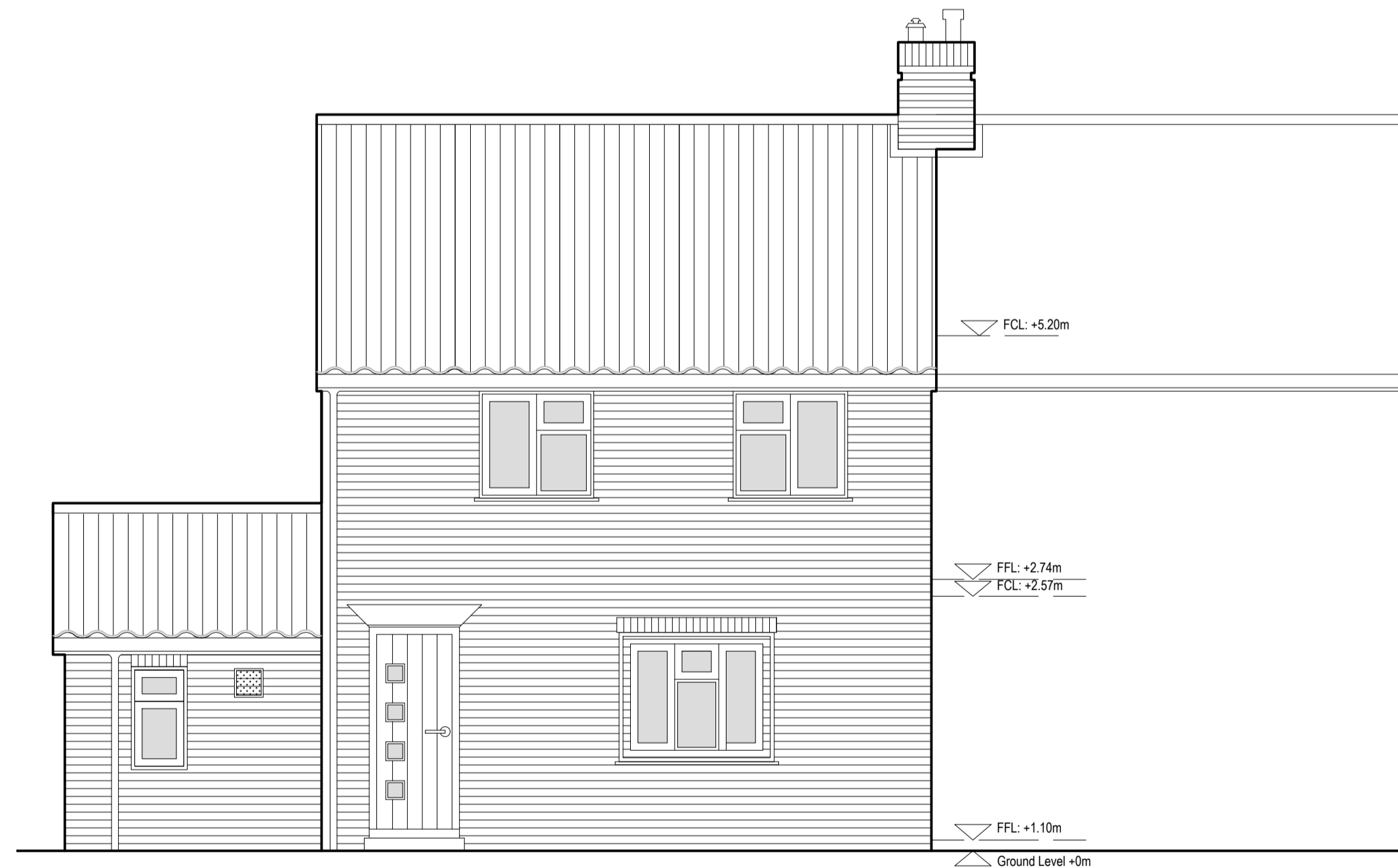
EXISTING EAST ELEVATION @ 1:50 SCALE