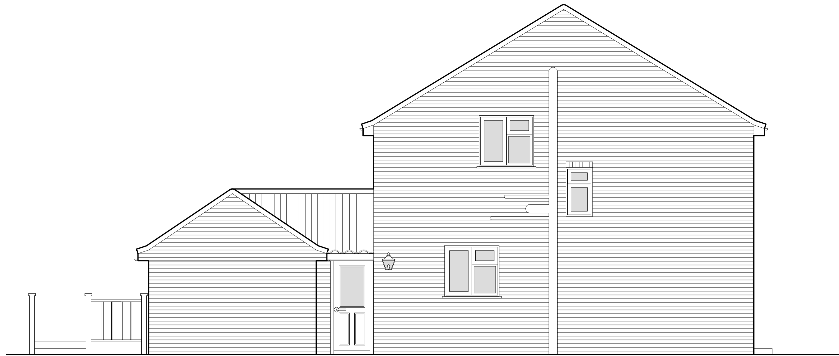
EXISTING SOUTH ELEVATION @ 1:50 SCALE