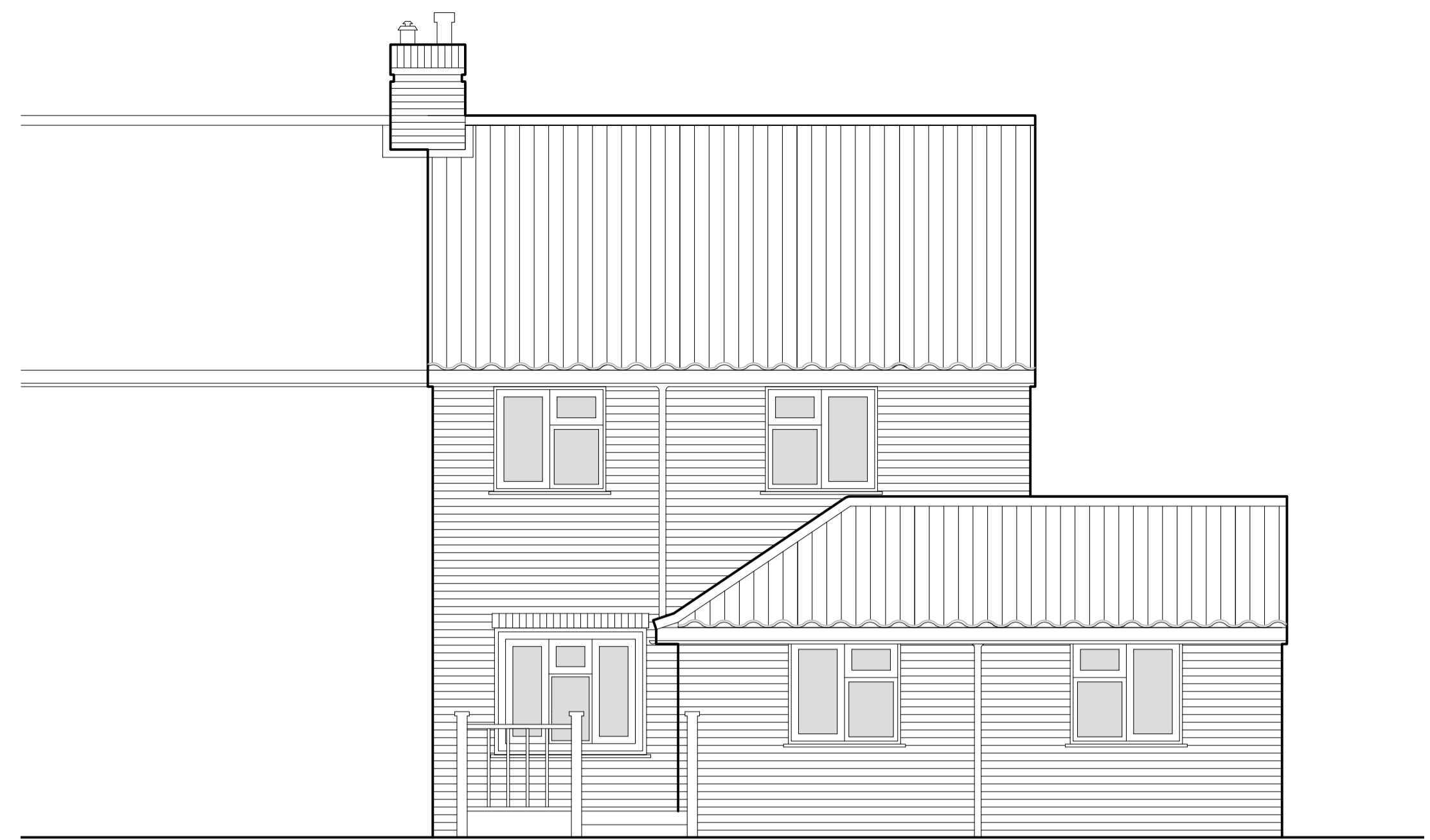
EXISTING WEST ELEVATION @ 1:50 SCALE