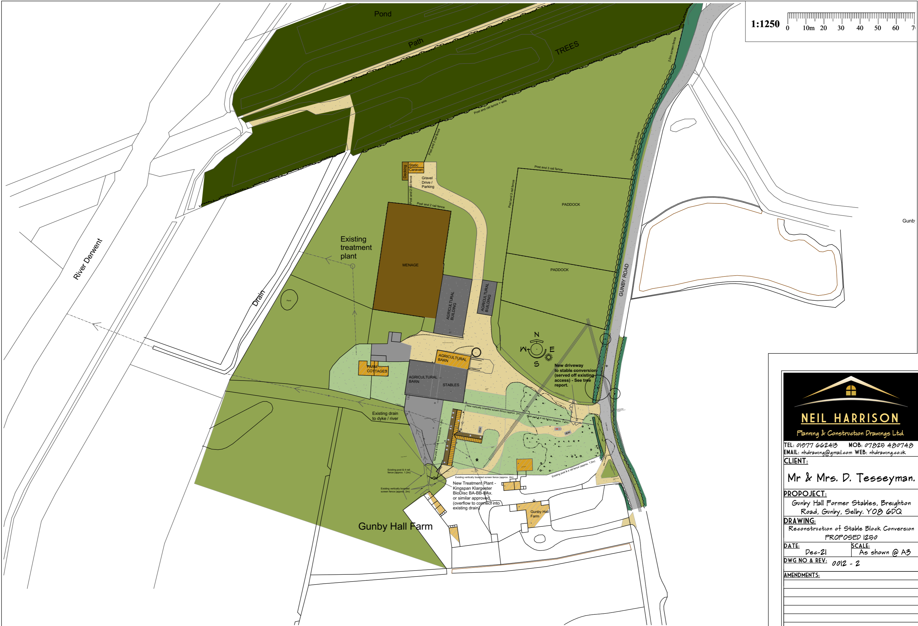
Location Plan (4)