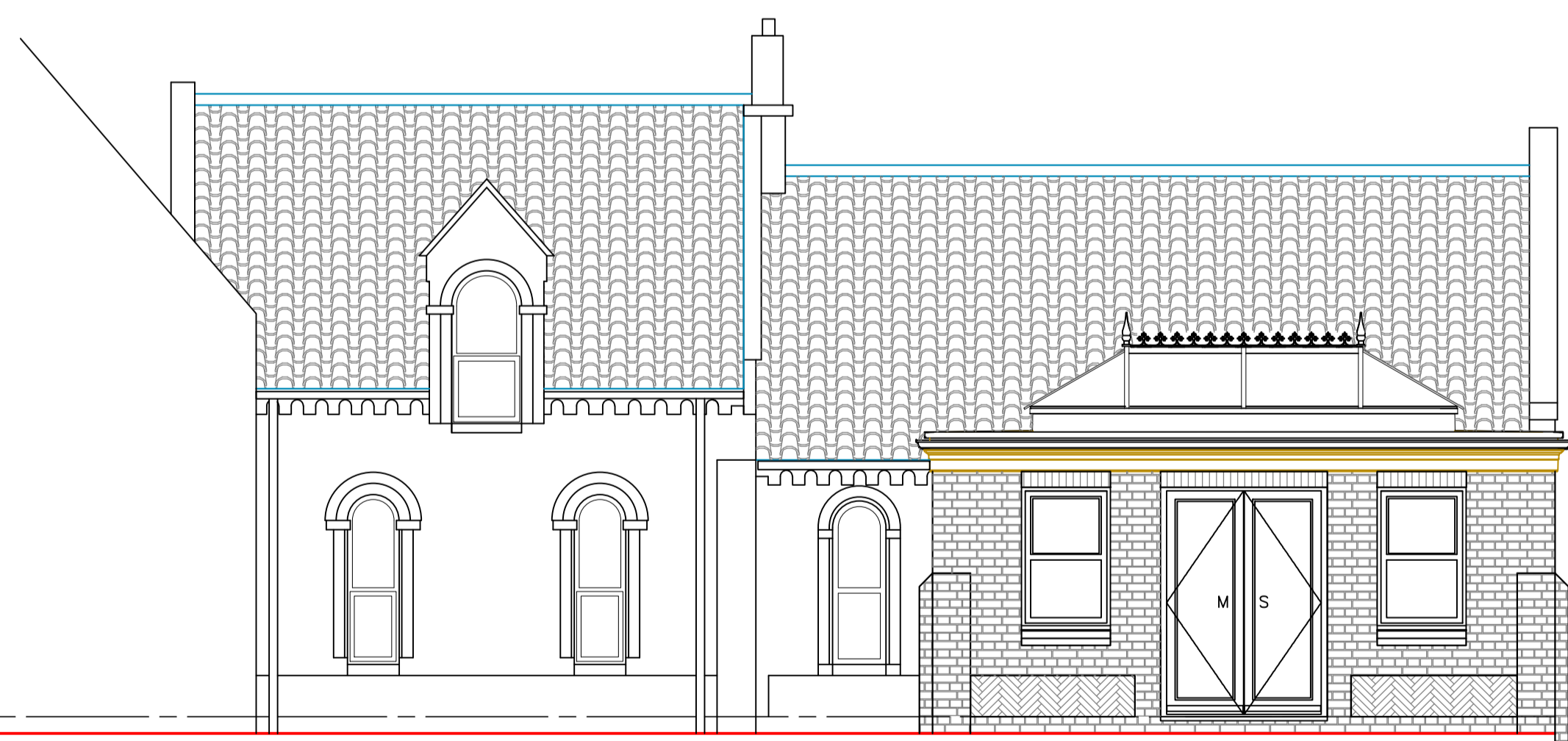
Front Elevation on Orangery