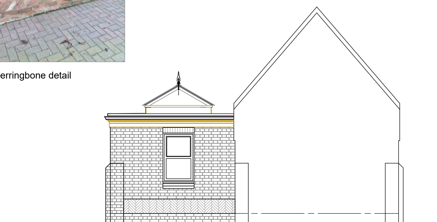
Side Elevation on Orangery