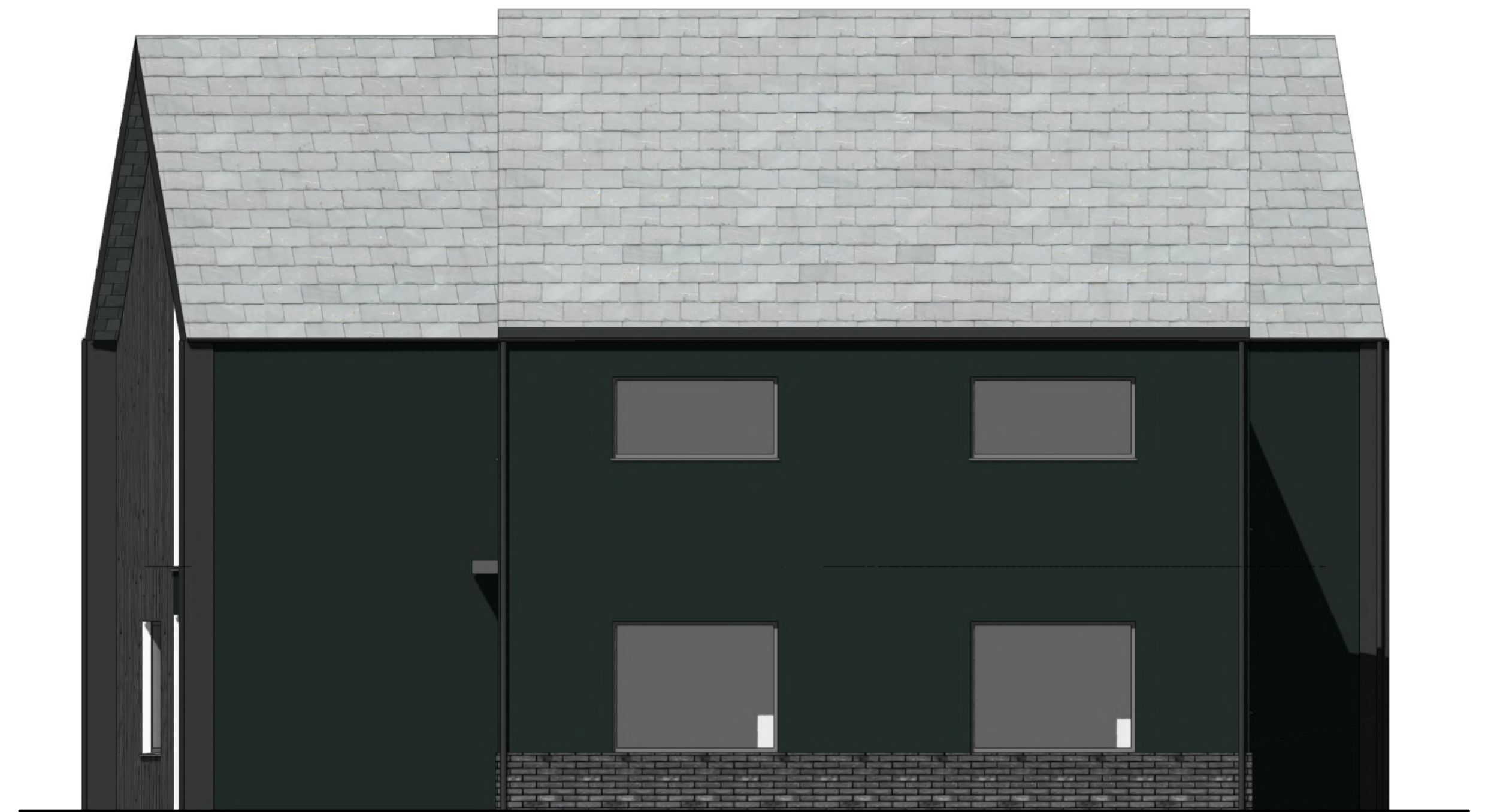
WEST ELEVATION 1:50

Natural slate Black stained vertical timber weatherboarding Black colour through render Window, doors, gutters, downpipes, metal work. Colour Black RAL 9004 Black colour through render