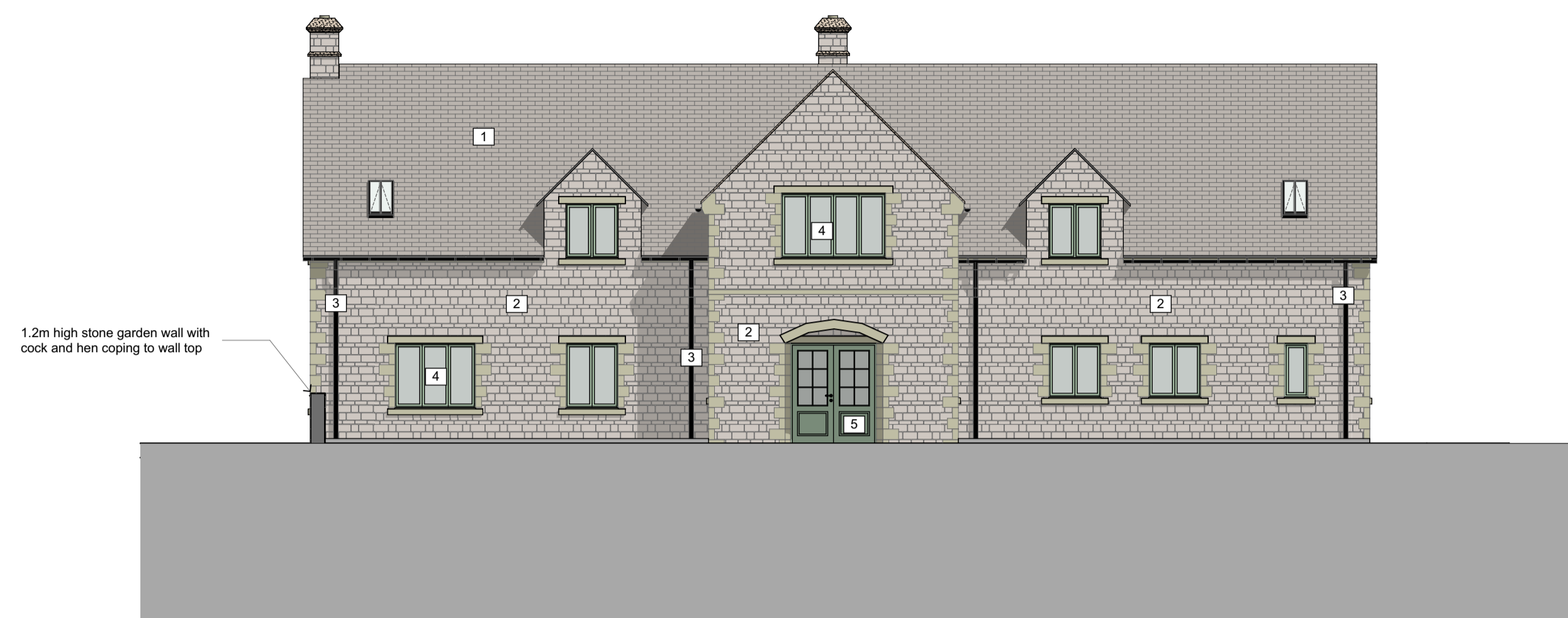
1 East Dwelling Elevation 1:100