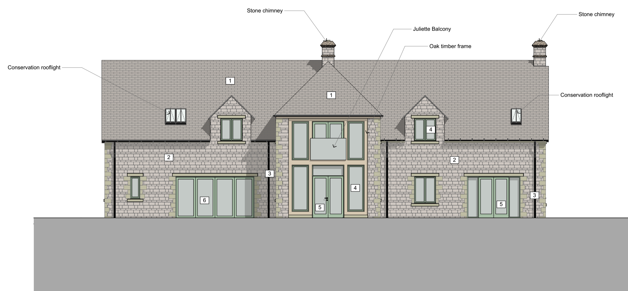
3 West Dwelling Elevation 1:100