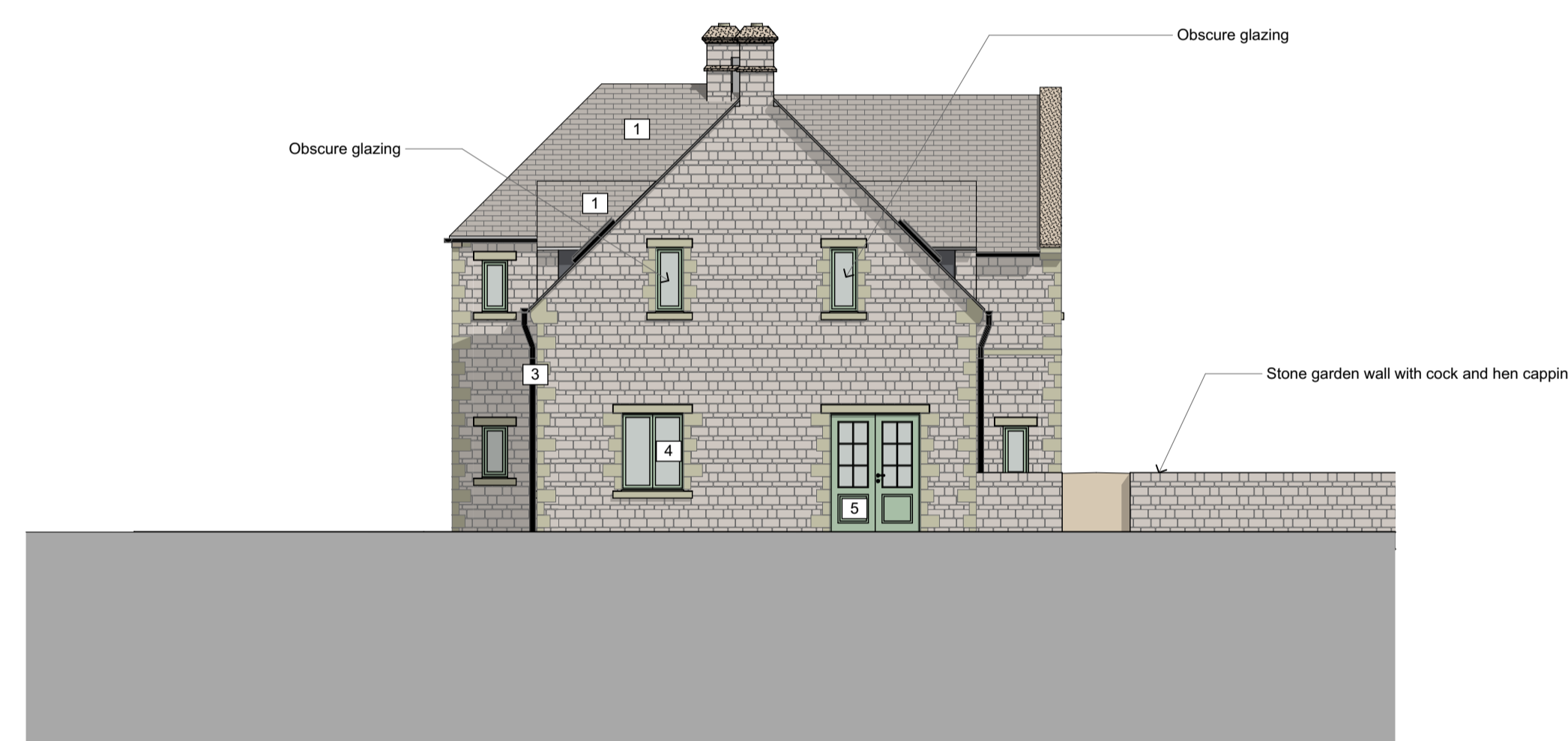
4 South Dwelling Elevation 1:100