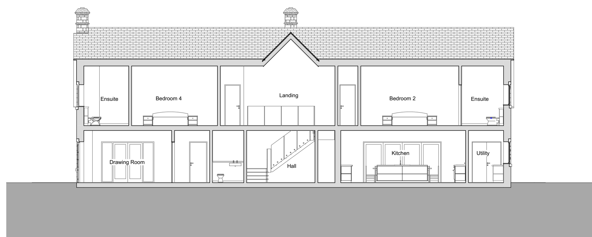
5 Building Section AA 1:100