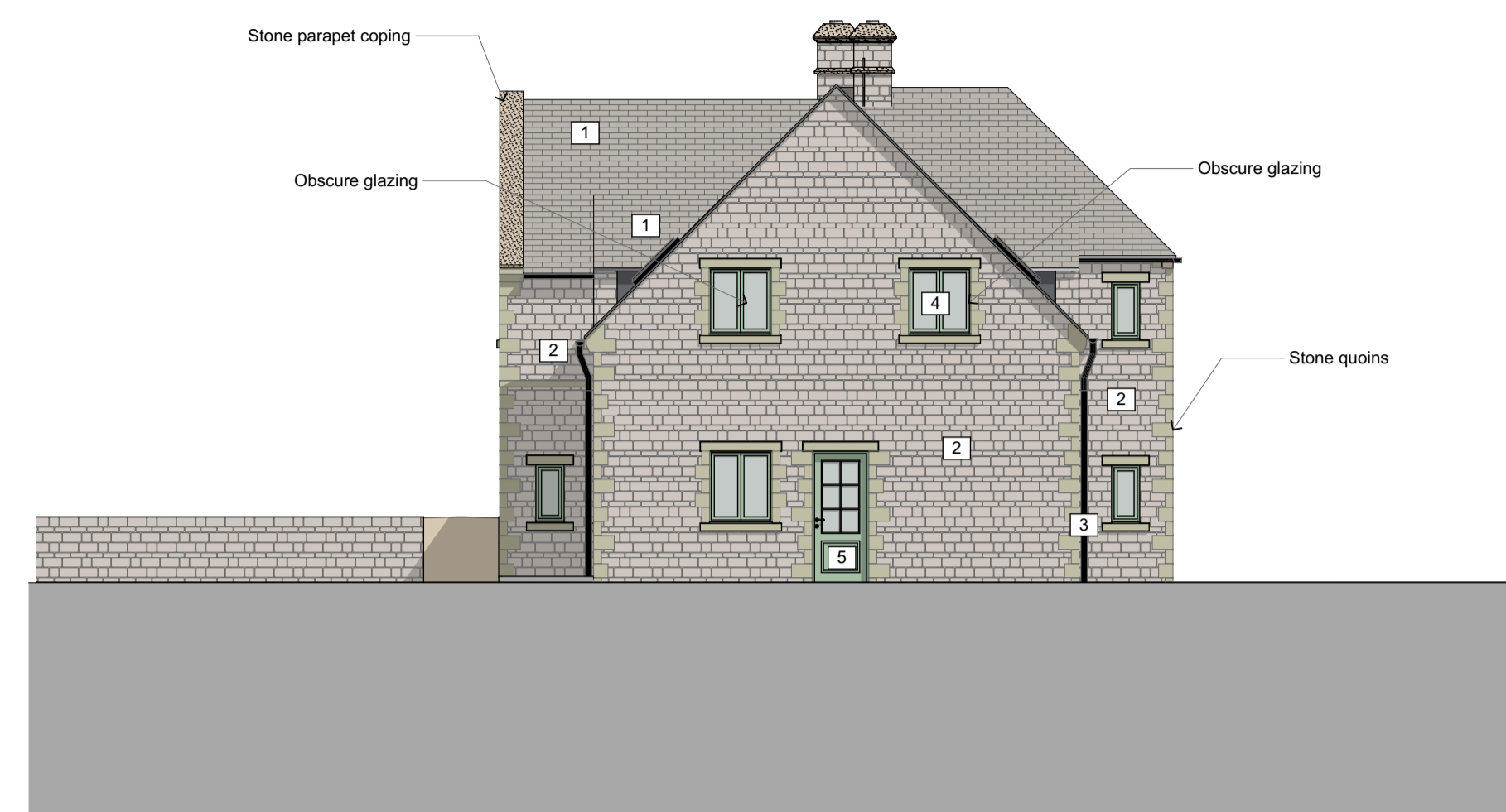
2 North Dwelling Elevation 1:100