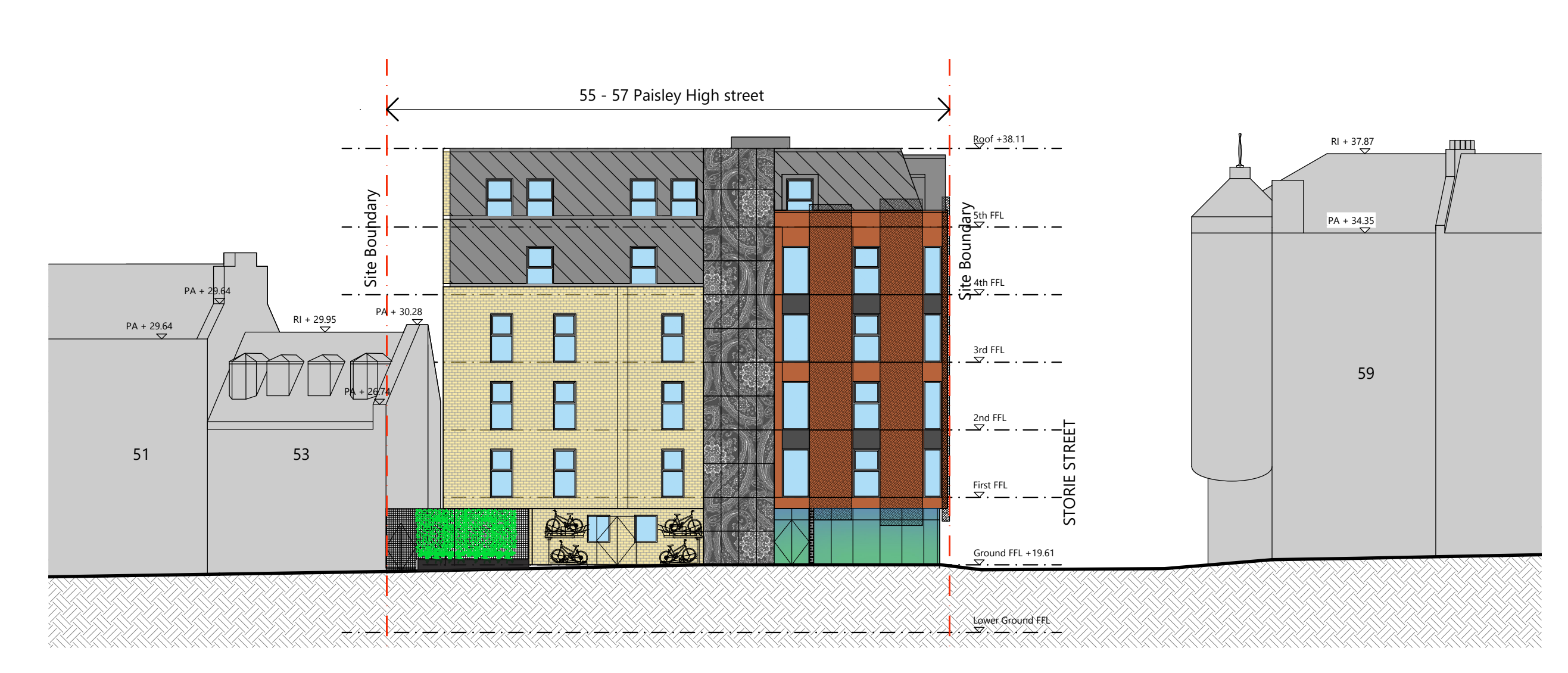
North Elevation (as viewed from High St) Scale 1:200 on A1