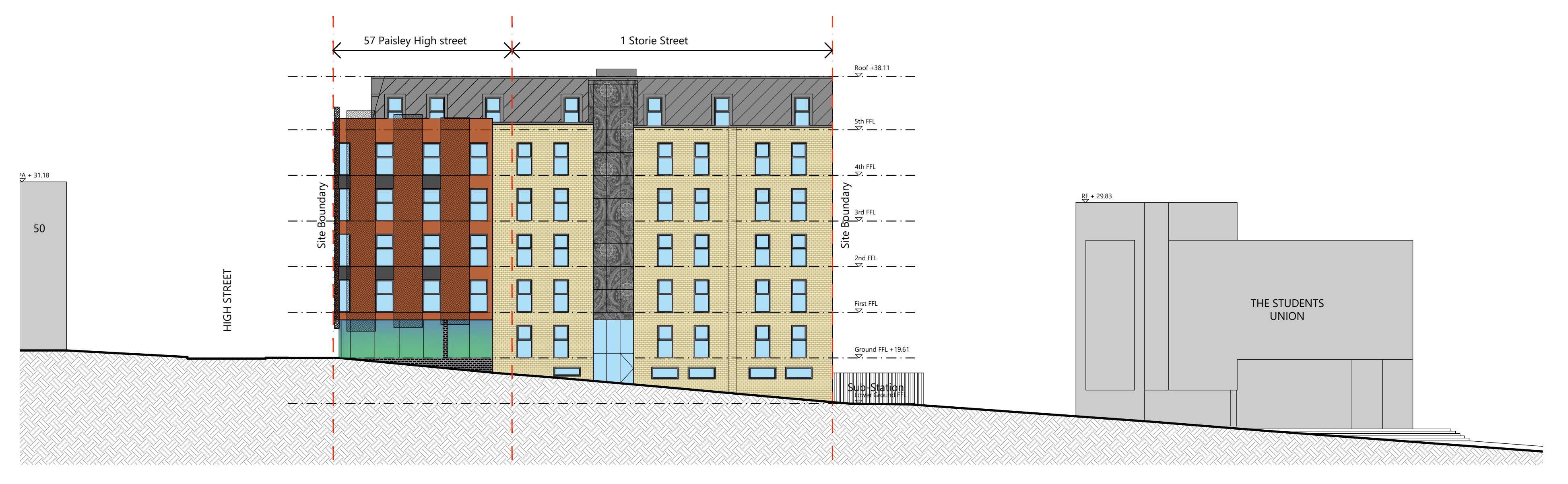
West Elevation (as viewed from Storie Street)