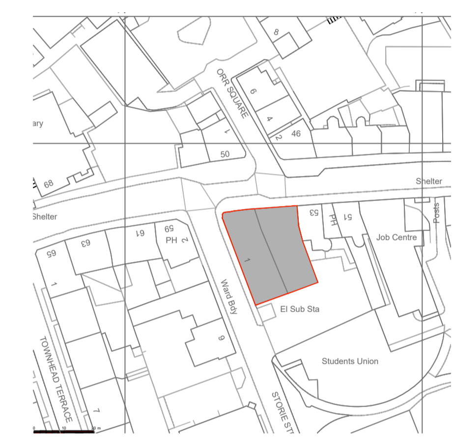
Location Plan Scale 1:1250 on A1