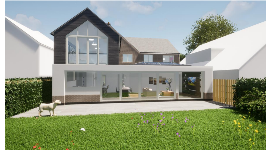
Indicative Rear Visual (nts)