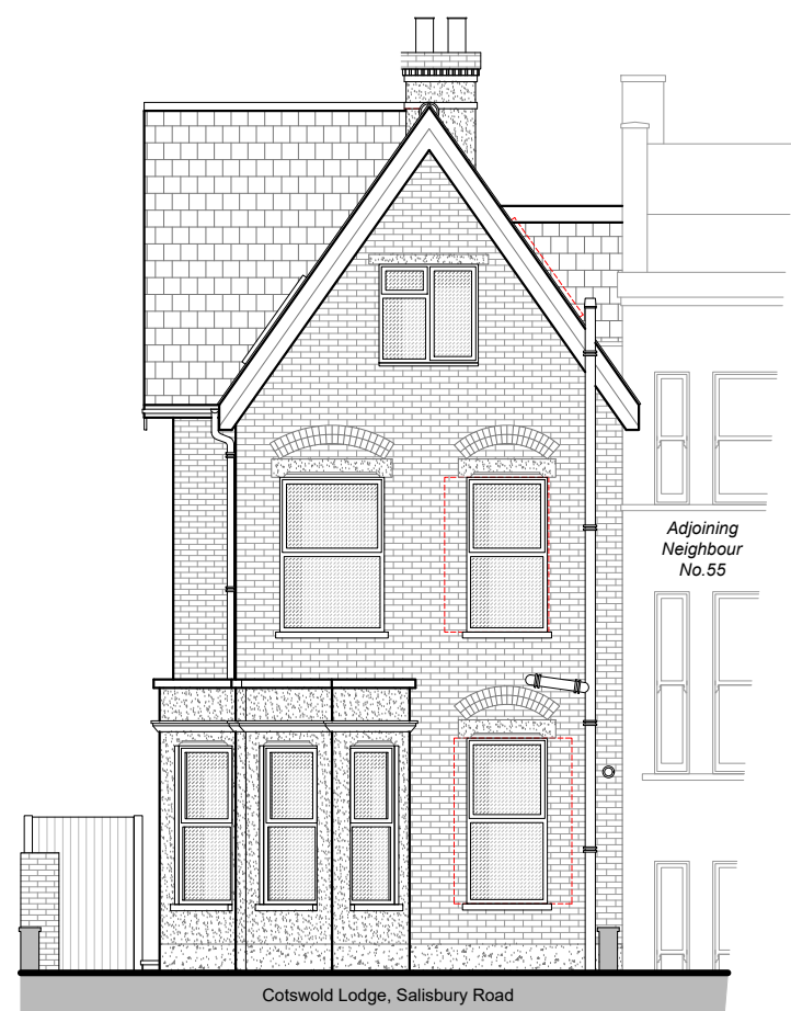
Side Elevation As Proposed - Scale 1:100