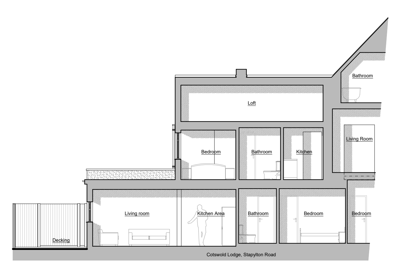
Section A-A As Existing - Scale 1:100