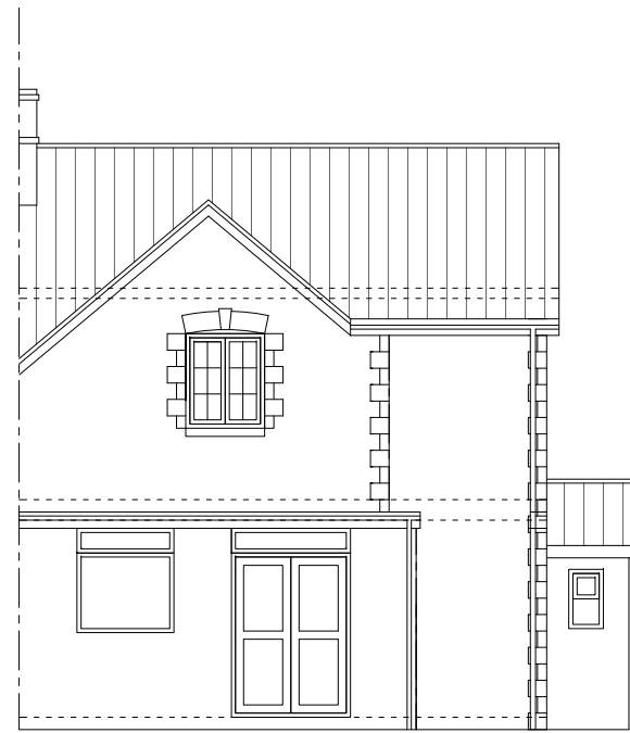
REAR ELEVATION - 1:100