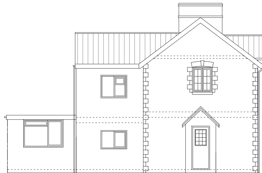
SIDE ELEVATION - 1:100