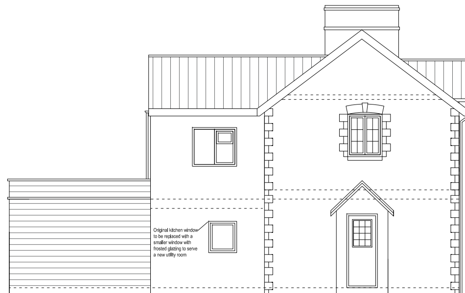
SIDE ELEVATION - 1:100