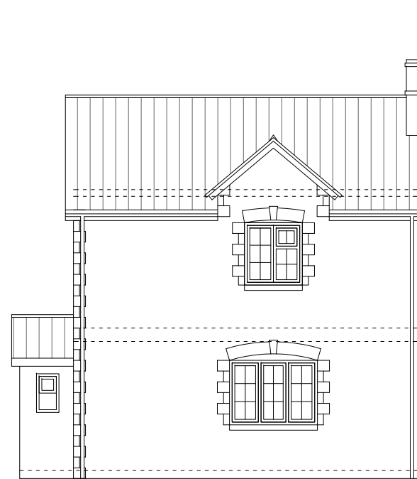
FRONT ELEVATION - 1:100