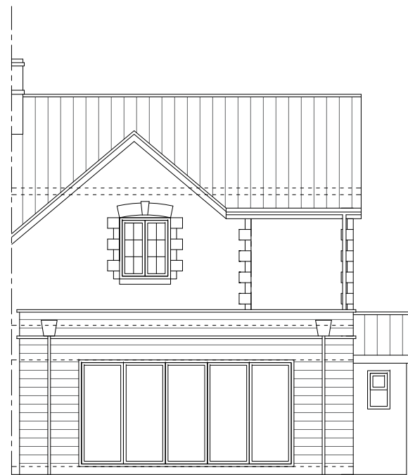
REAR ELEVATION - 1:100