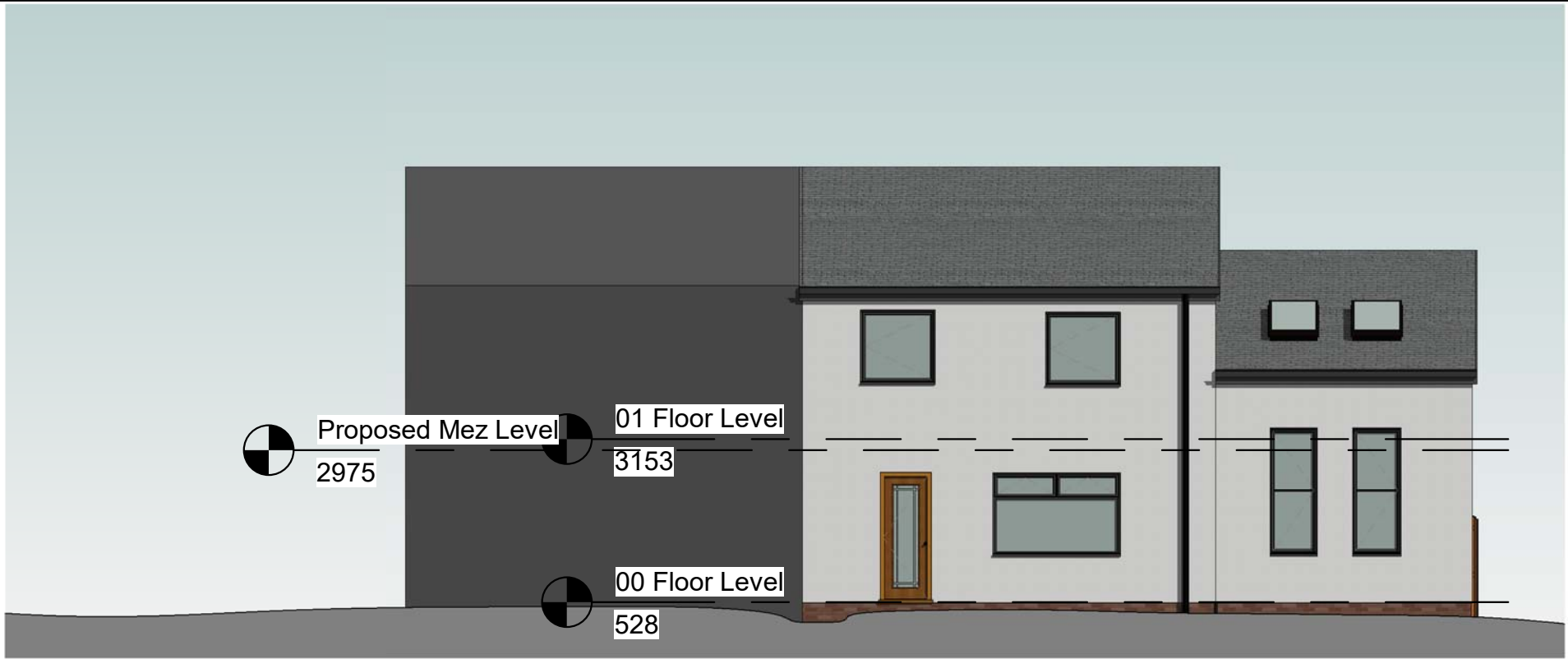
1 Proposed Front Elevation 1 : 100