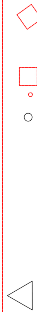
PROPOSED FLOOR PLAN 1:50

3no SHIPPING CONTAINERS 6m x 12m TO FORM BACK STORAGE FACILITY.