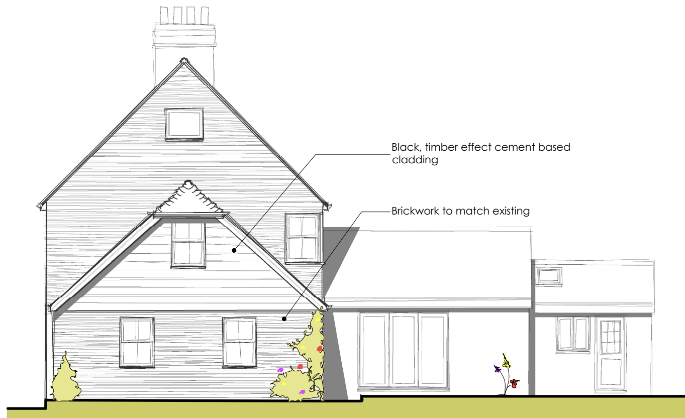
side - south west