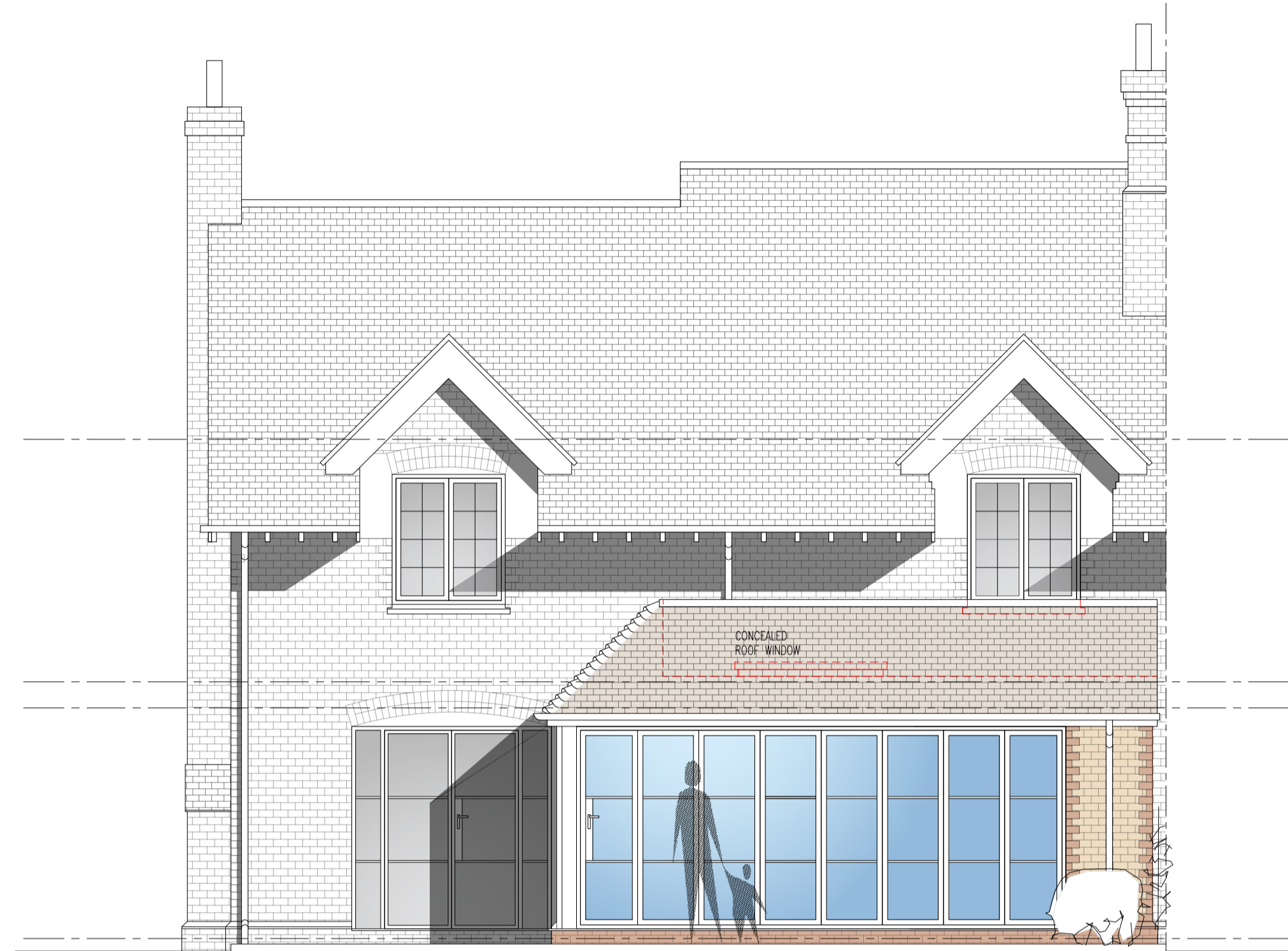
1 REAR ELEVATION PROPOSED Scale 1:50

EXTERNAL FINISHES FLAT ROOF - GREEN/LIVING ROOF SYSTEM WALLS - FACING BRICKWORK & DETAILING TO MATCH EXISTING WINDOWS & DOORS - CRITICAL STYLE TO MATCH EXISTING FASCIA - PAINTED TIMBER TO MATCH EXISTING RAINWATER GOODS - BLACK uPVC TO MATCH EXISTING