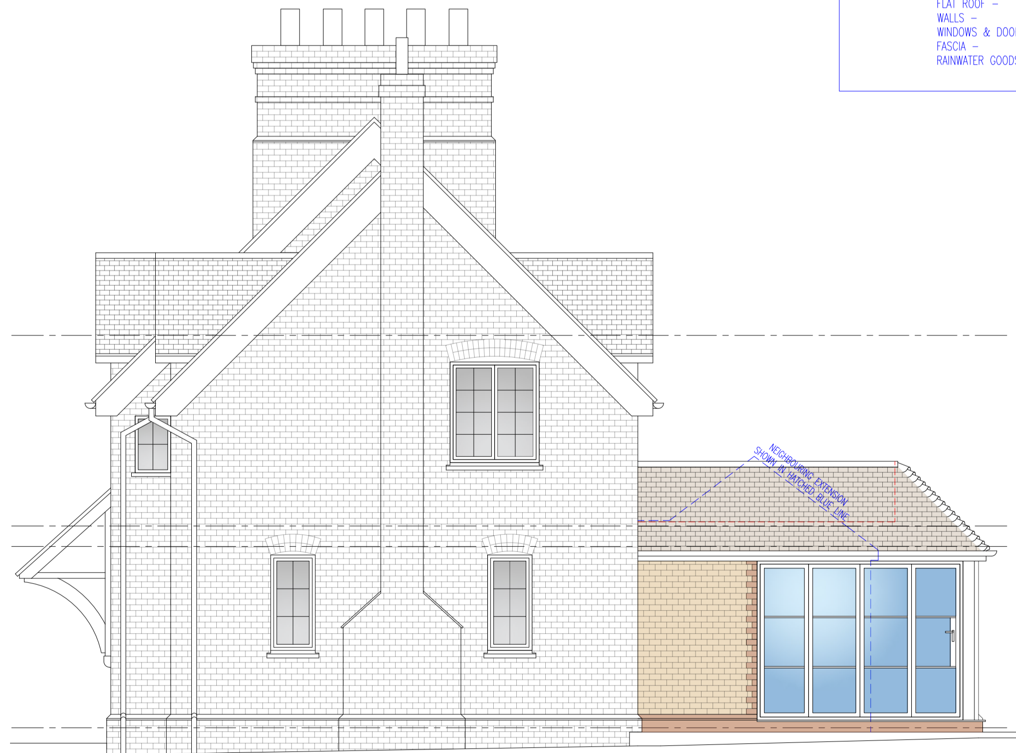
2 SIDE ELEVATION PROPOSED Scale 1:50

EXTERNAL FINISHES FLAT ROOF - GREEN/LIVING ROOF SYSTEM WALLS - FACING BRICKWORK & DETAILING TO MATCH EXISTING WINDOWS & DOORS - CRITICAL STYLE TO MATCH EXISTING FASCIA - PAINTED TIMBER TO MATCH EXISTING RAINWATER GOODS - BLACK uPVC TO MATCH EXISTING