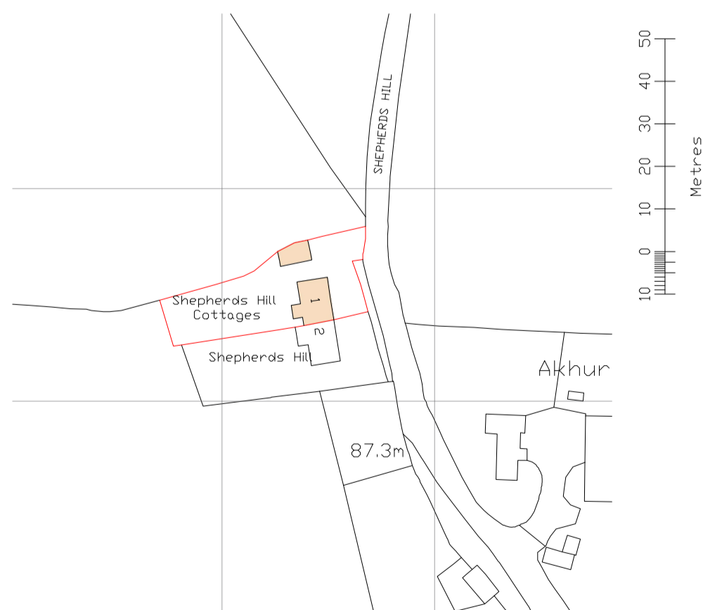
3 SITE PLAN Scale 1:1250