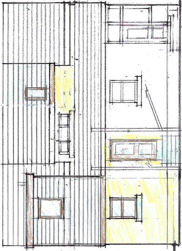
REAR ELEVATION (1:100)