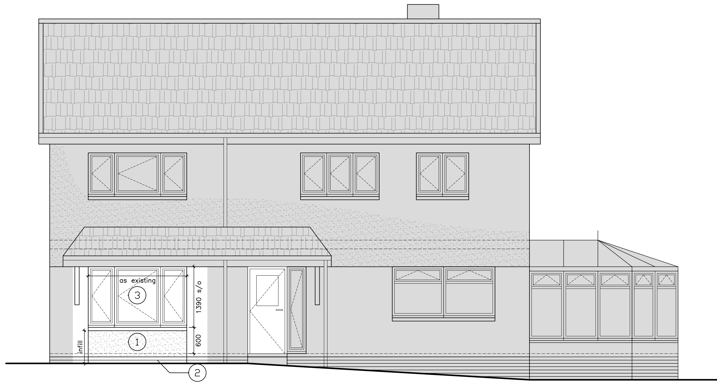
Proposed Front Elevation 1:50