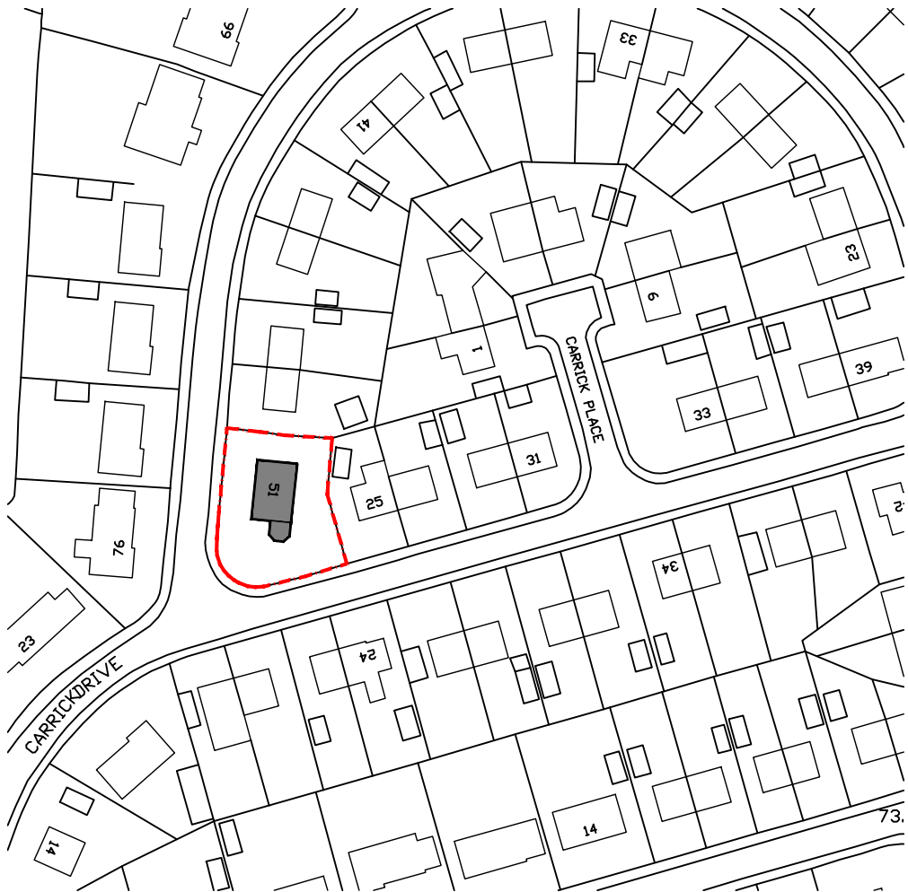
Existing Location Plan 1:1250