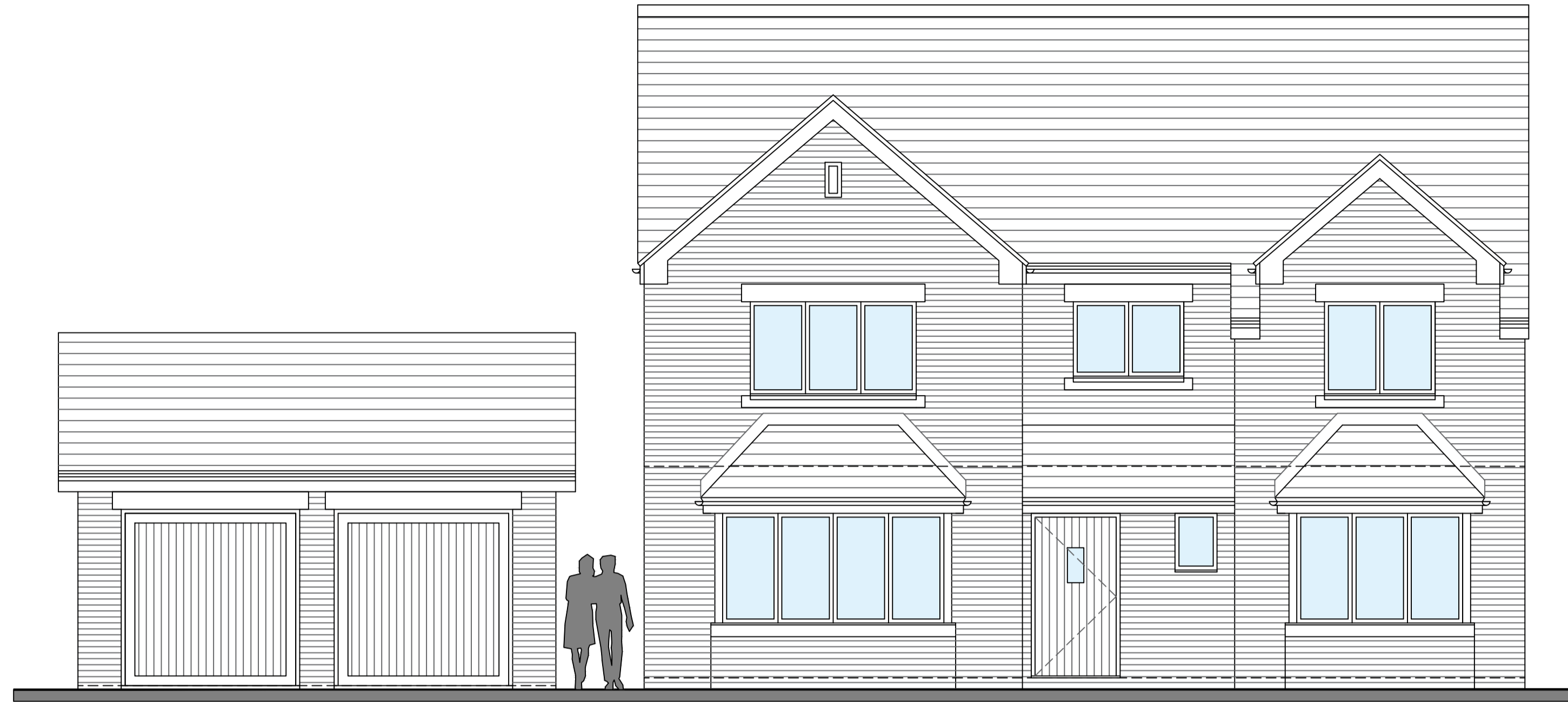
1:50 PROPOSED SOUTH FACING ELEVATION (To Moss House Road)