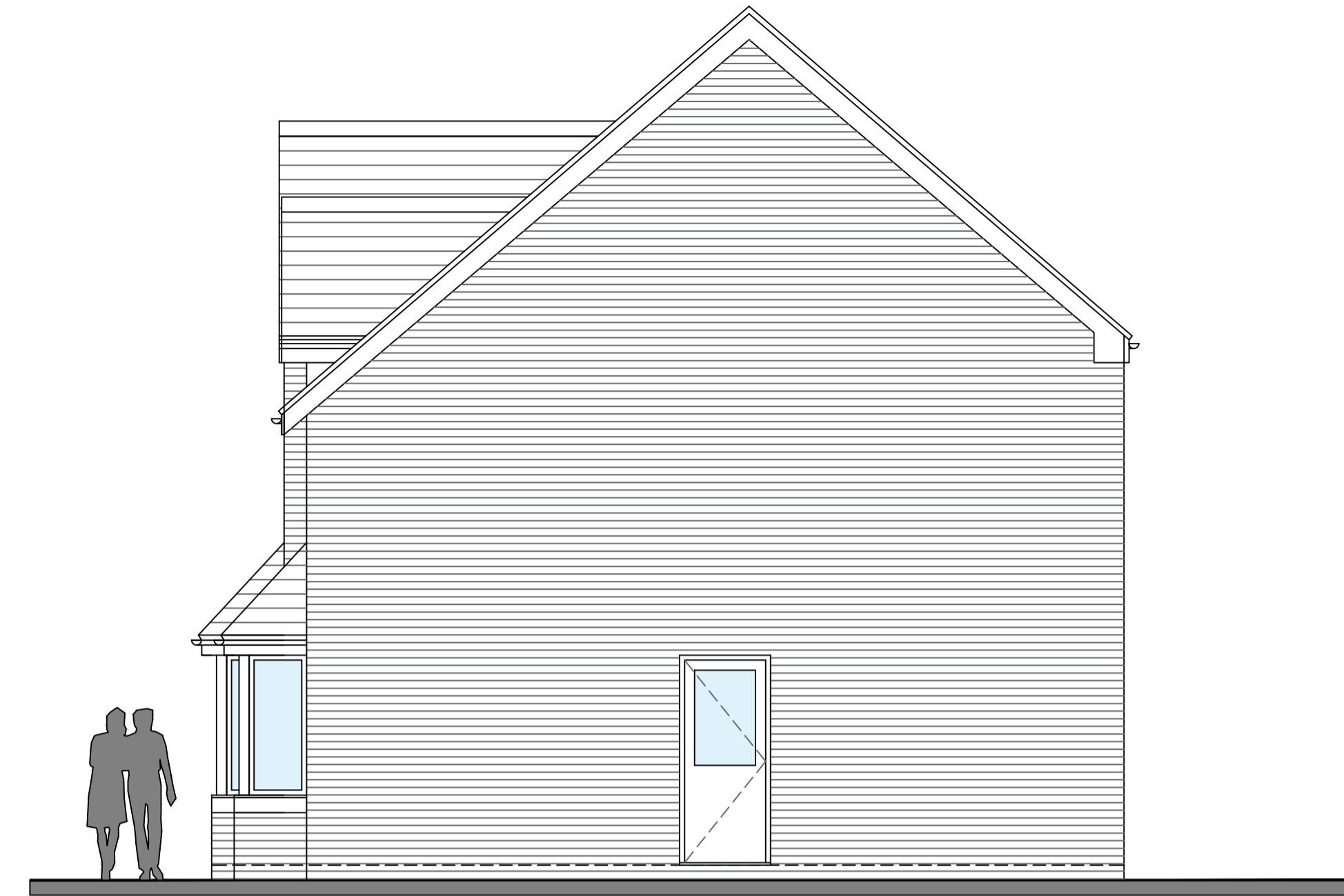
1:50 PROPOSED EAST FACING ELEVATION (To 47 Moss House Road)