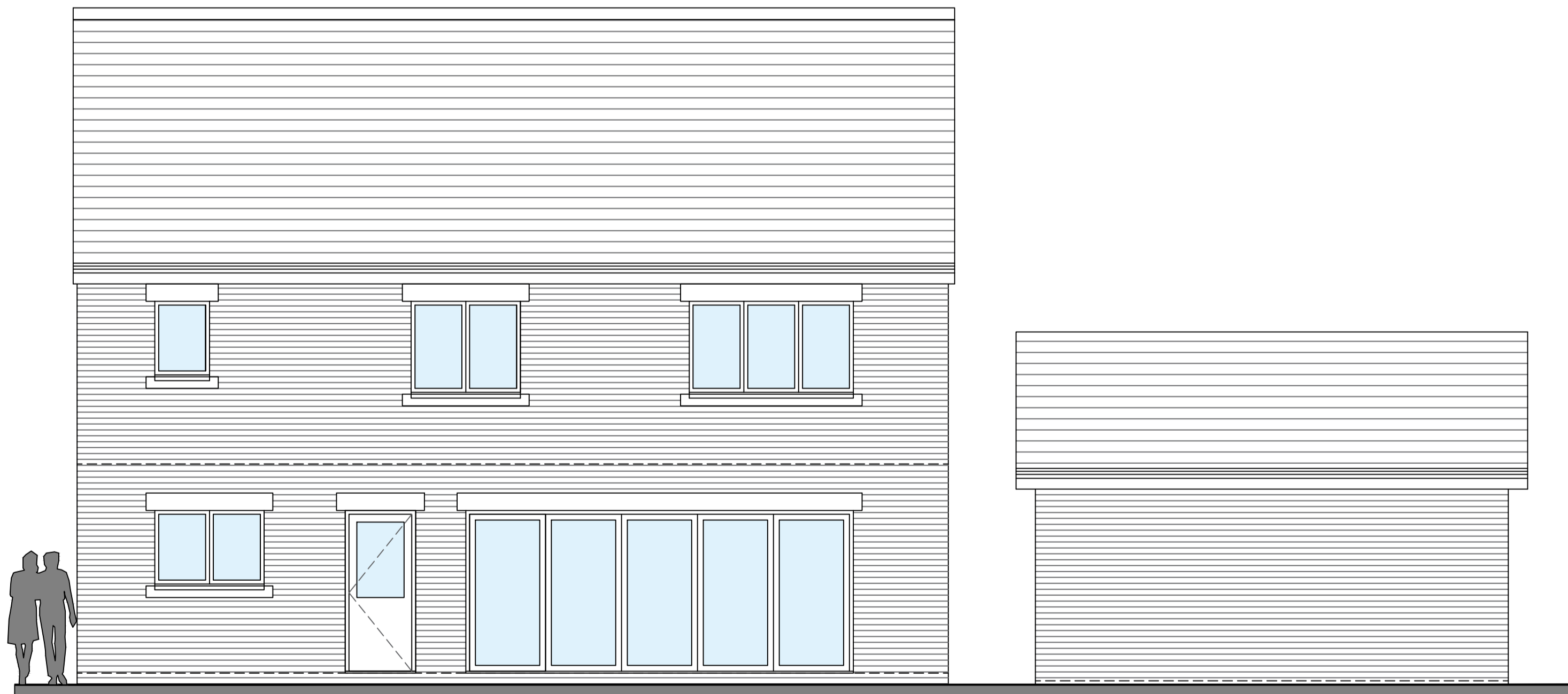
1:50 PROPOSED NORTH FACING ELEVATION (To Rear Garden)