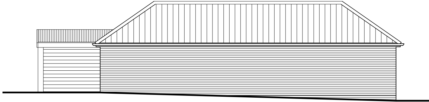
Elevation to East - Facing Ipswich Road