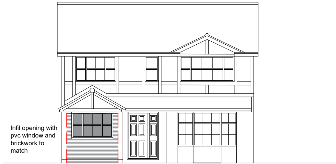
FRONT ELEVATION w as proposed