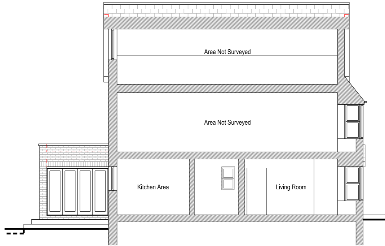
Section A - A