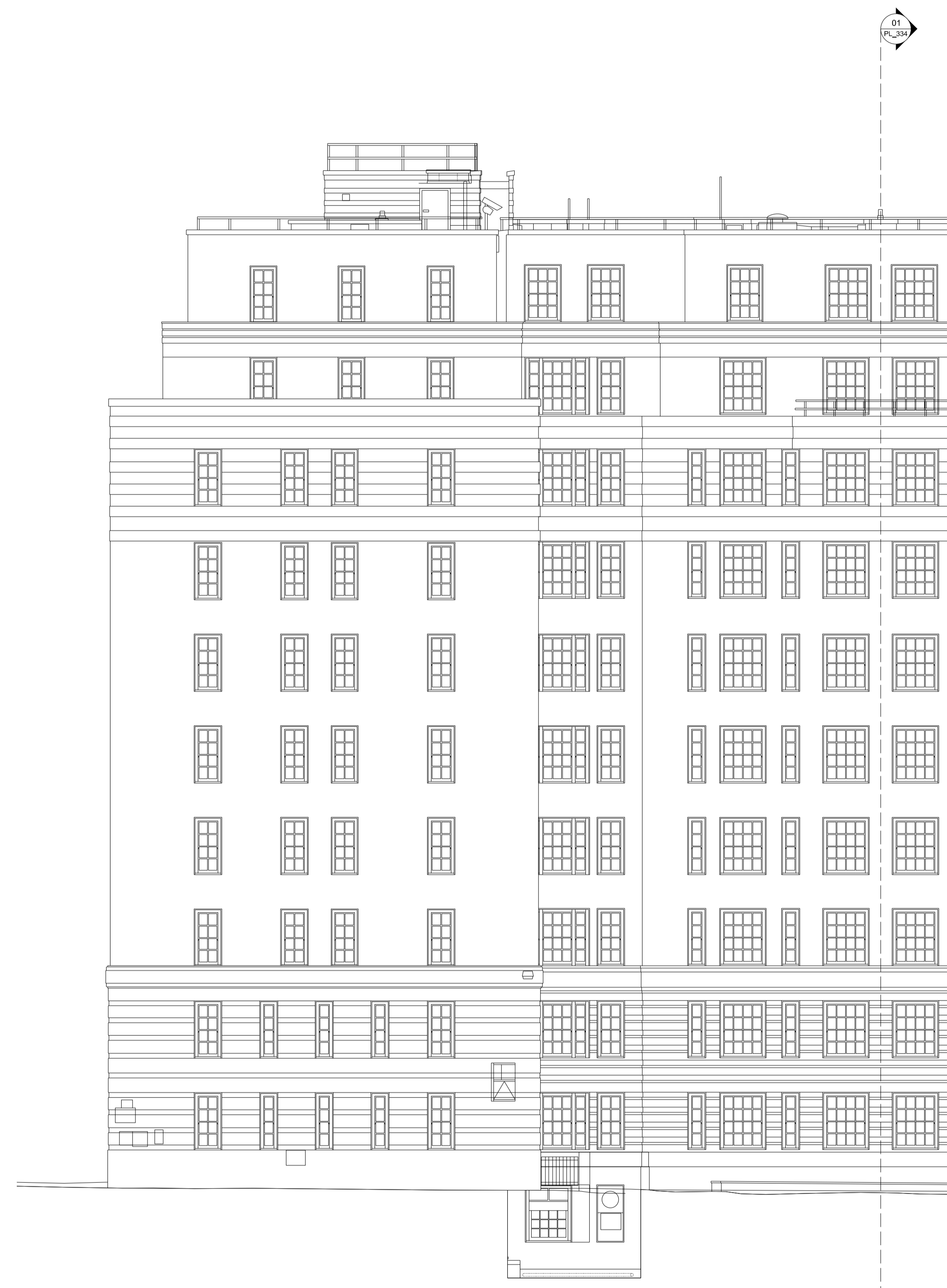
02 Grenville House Existing Elevation E-32 1:100