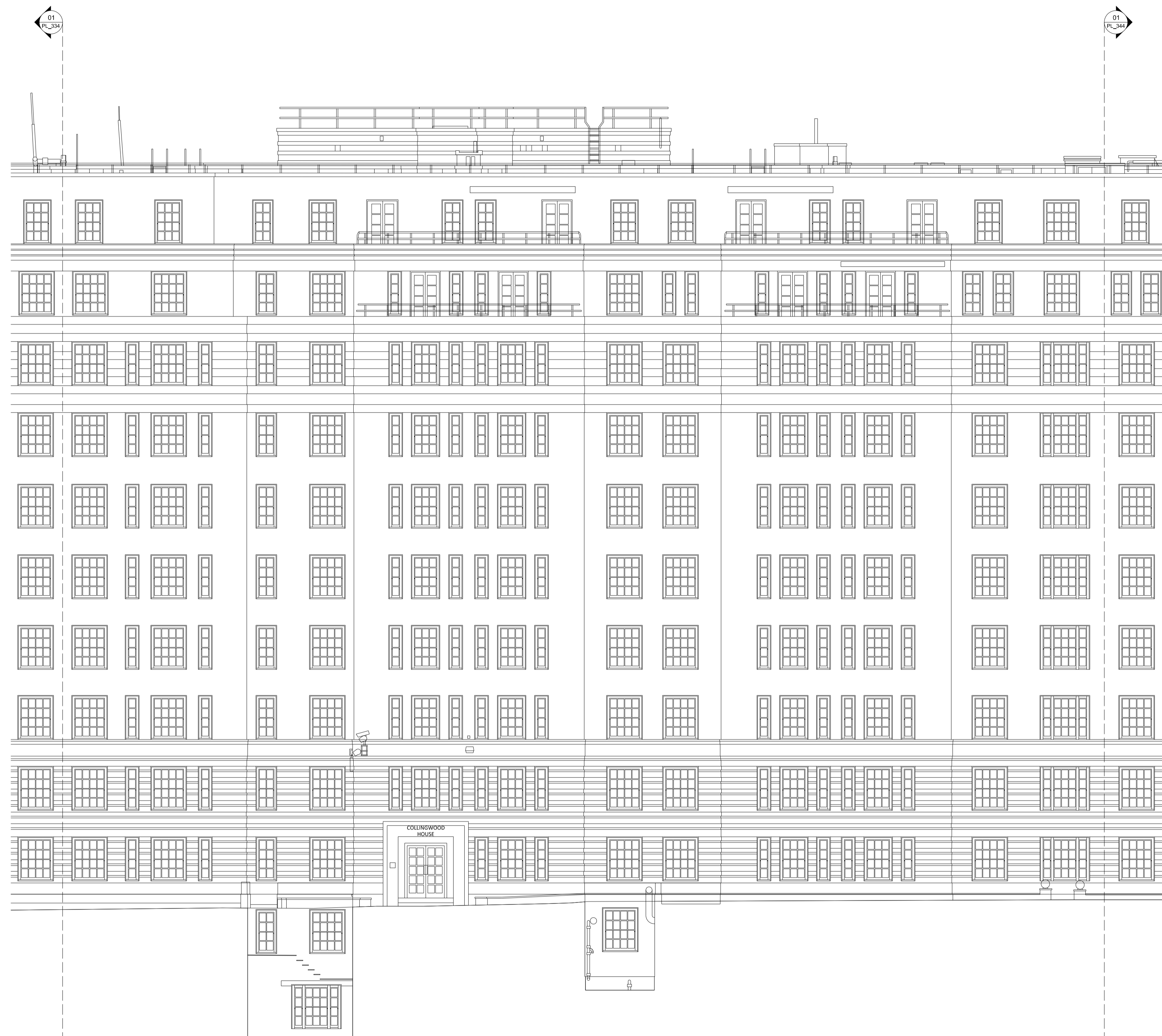
01 Collingwood House Existing Elevation E-02 1:100 Collingwood House