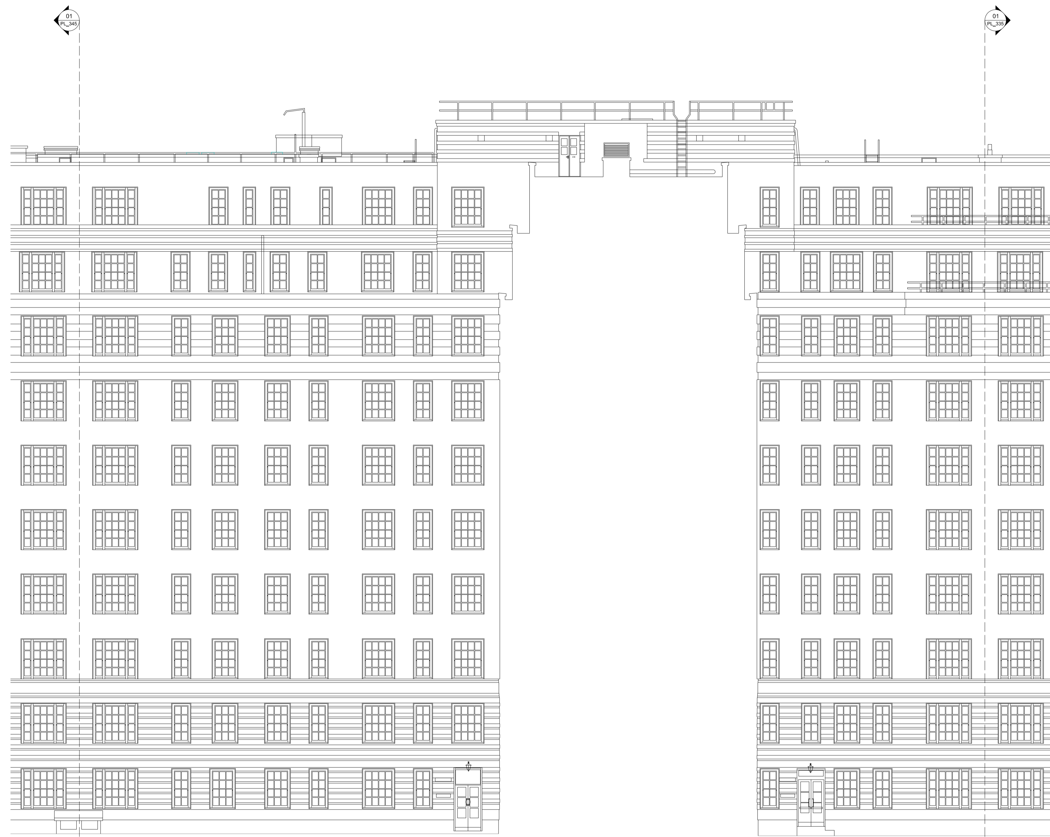
01 Collingwood House Existing Elevation E-06 1:100