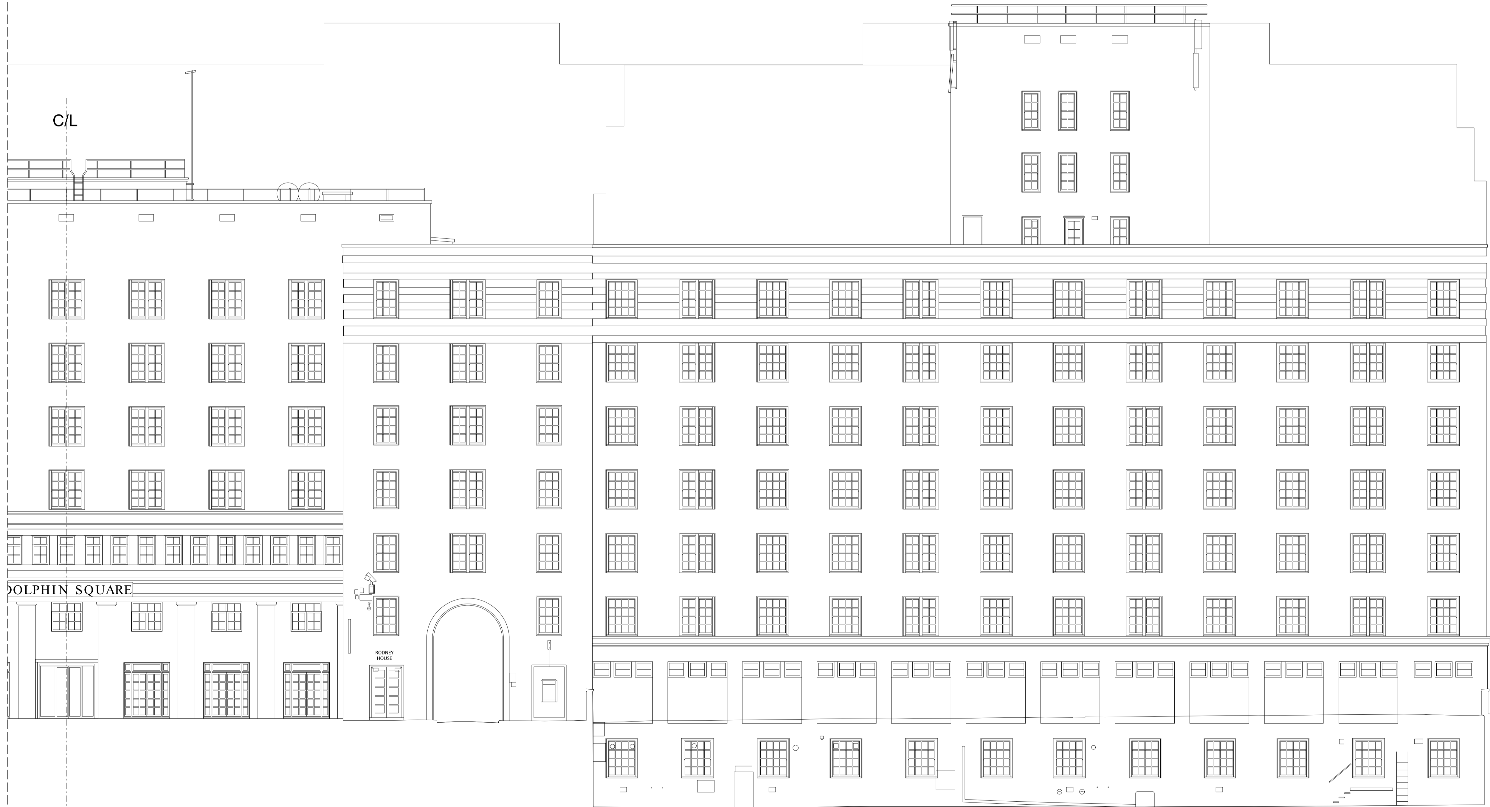
01 Rodney House Existing Elevation E-01 (2 of 2) 1:100