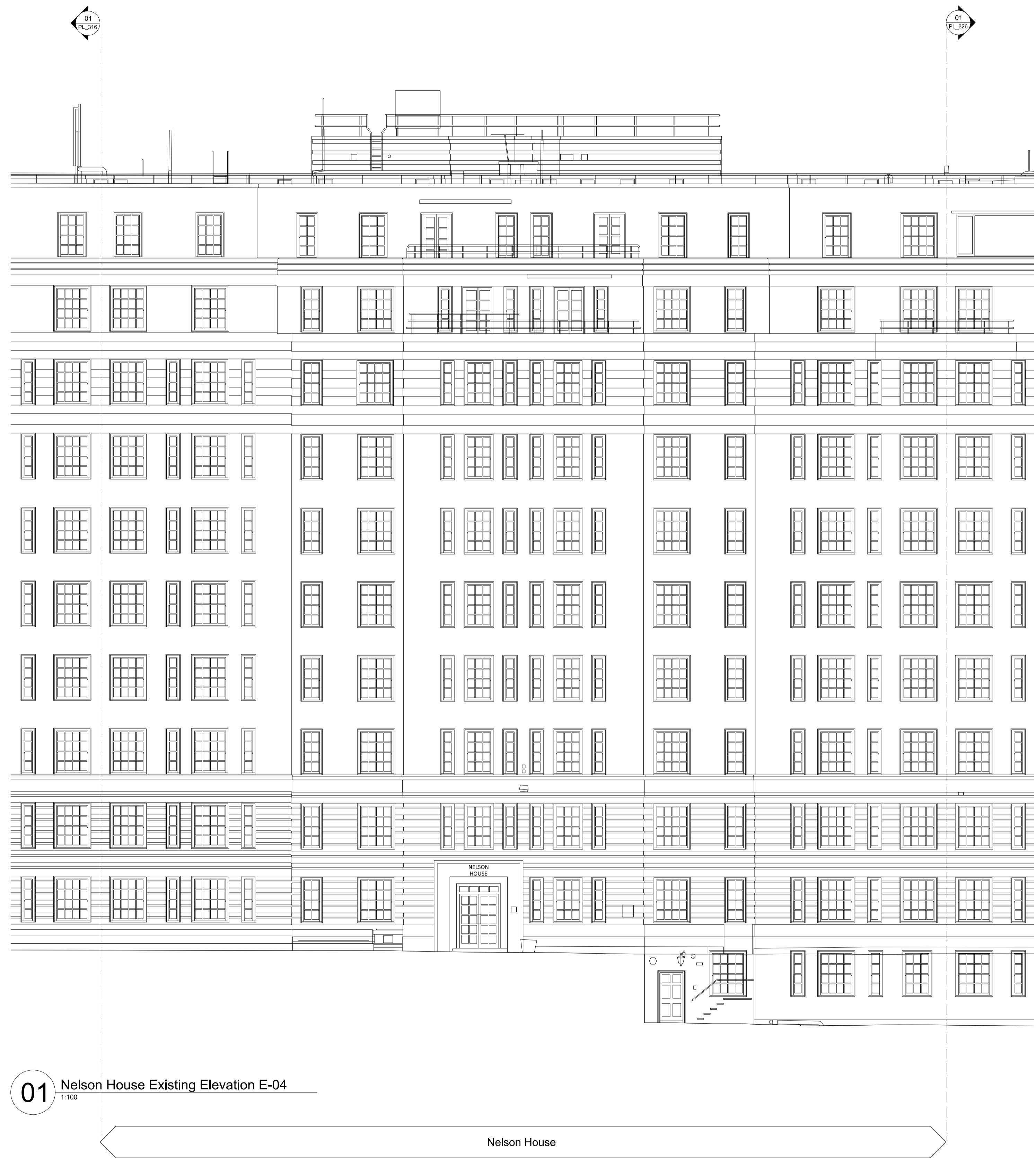
01 Nelson House Existing Elevation E-04 1:100