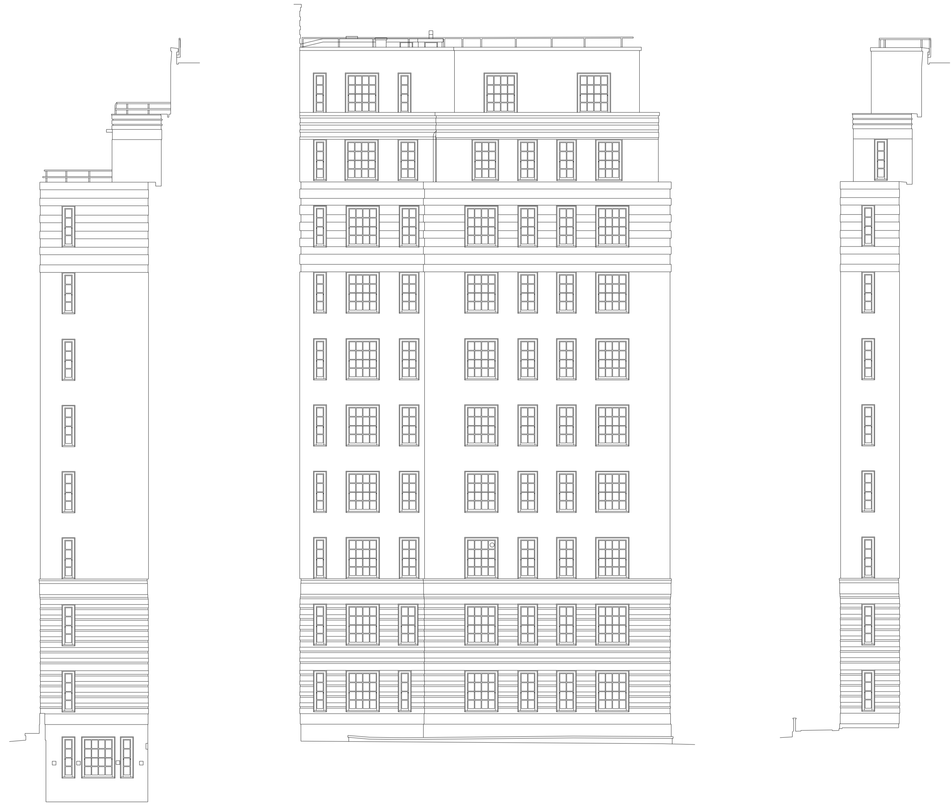
01 Nelson House Existing Elevation E-37 1:100