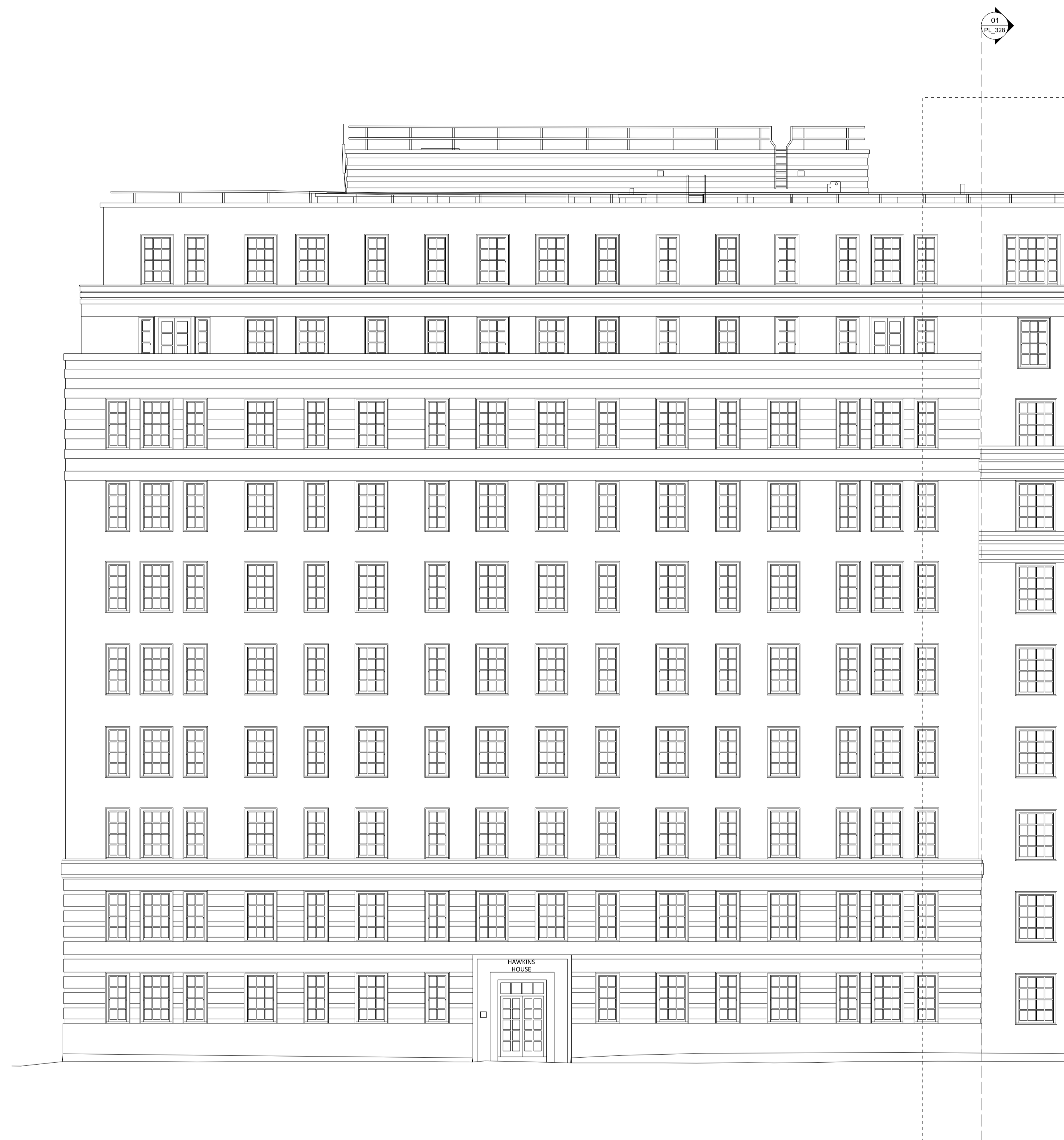
02 Hawkins House Existing Elevation E-03 1:100 Hawkins House