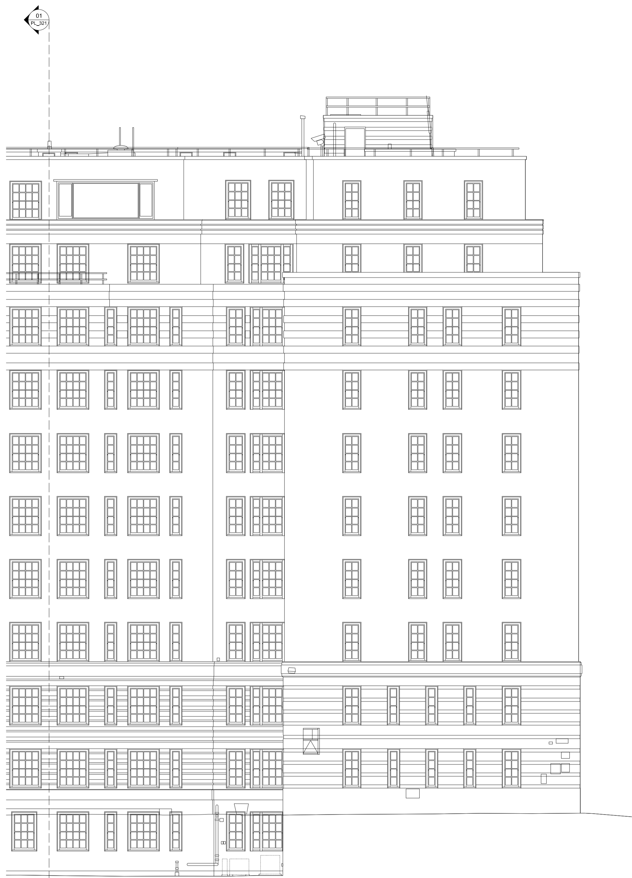
01 Hawkins House Existing Elevation E-33 1:100 Hawkins House