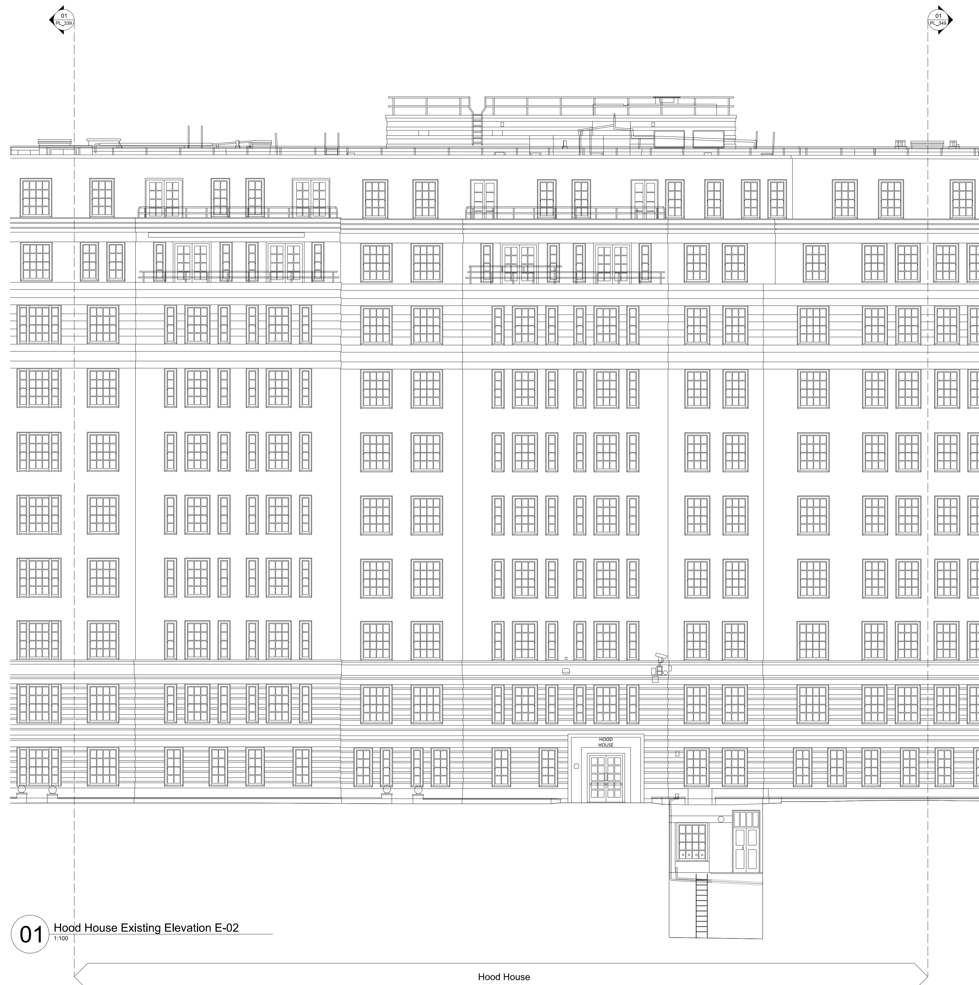
01 Hood House Existing Elevation E-02 1:100