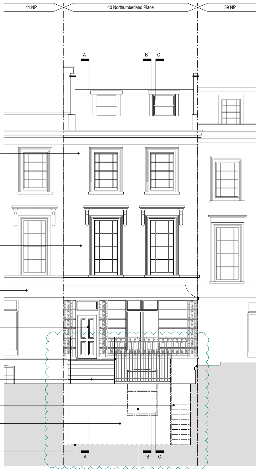
1 PROPOSED FRONT ELEVATION 1:100 @A3