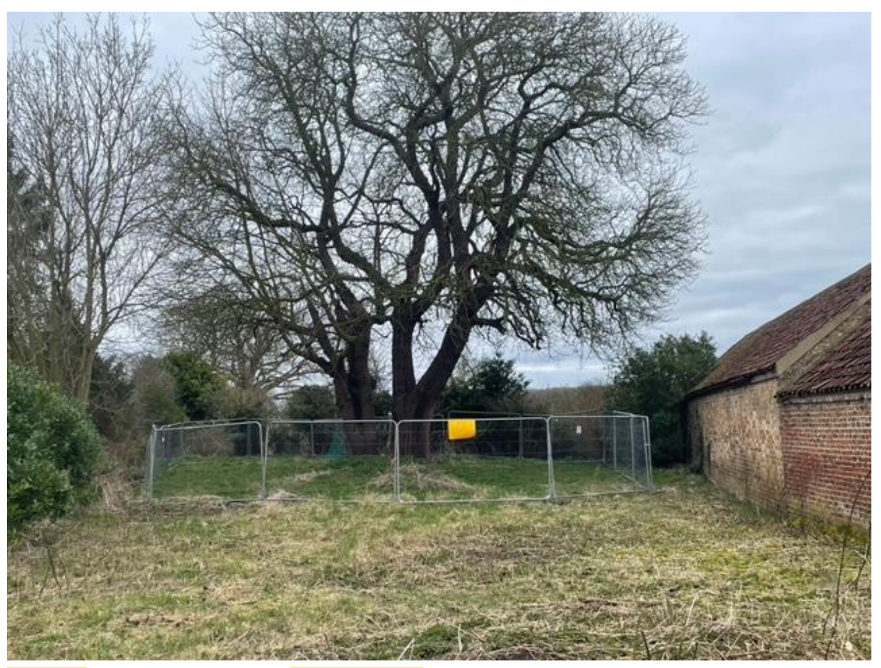
Photo 5 : Horse Chestnut T4, in March 2022, with protective fencing.