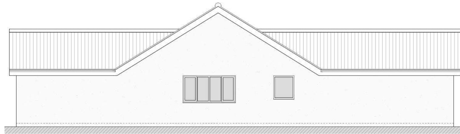
SIDE / WEST ELEVATION