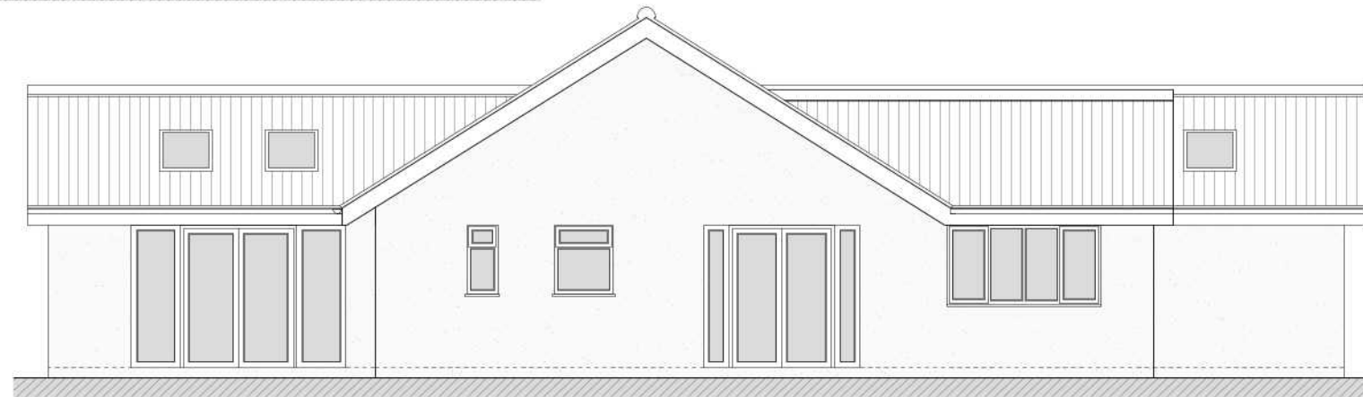
SIDE / WEST ELEVATION