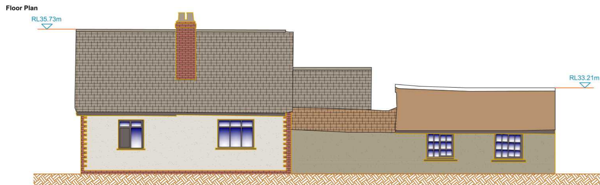
Side / West Elevation