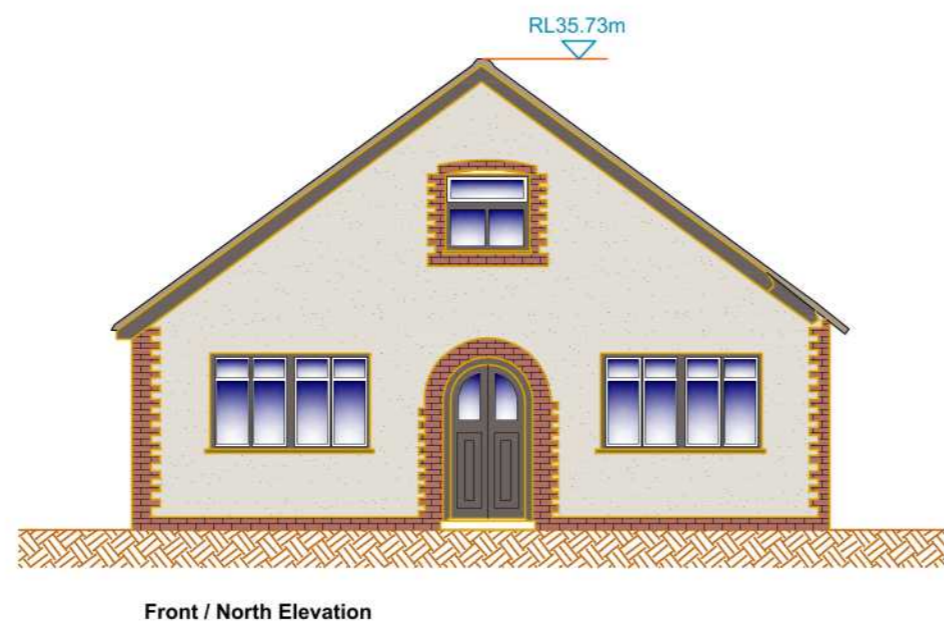
Front / North Elevation