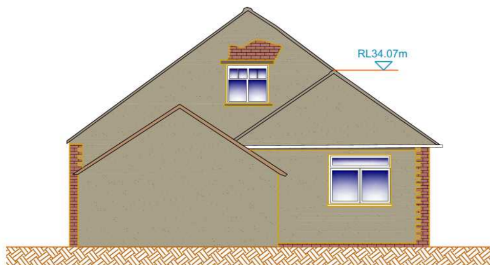
Rear / South Elevation