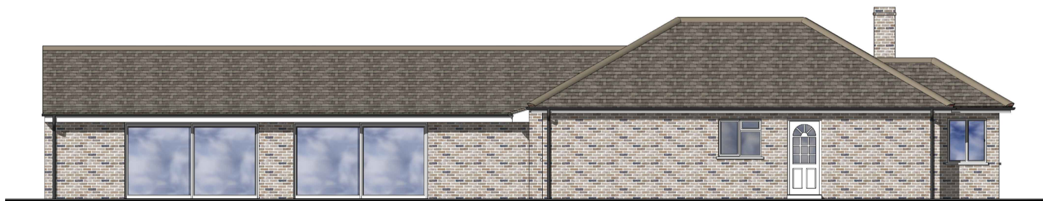
Side (South) Elevation