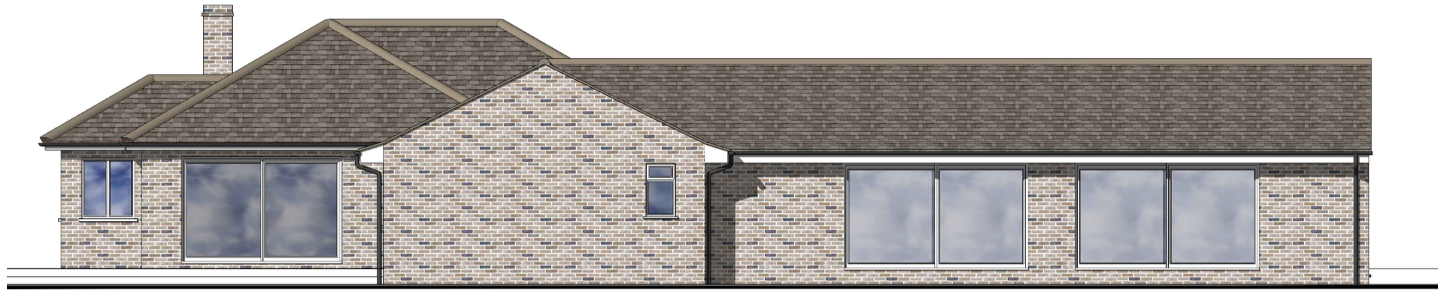
Side (North) Elevation