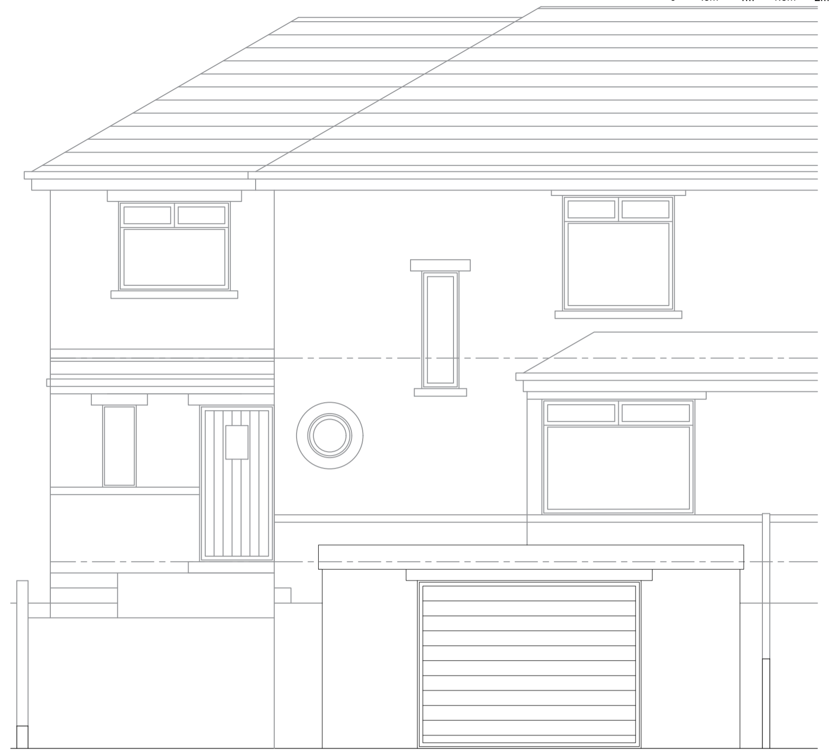
GARAGE ELEVATION (NORTH ELEVATION)