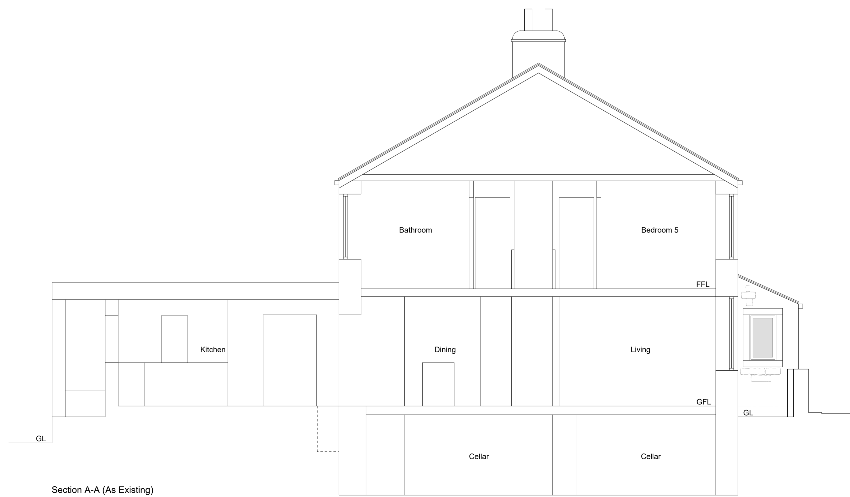
Section A-A (As Existing)