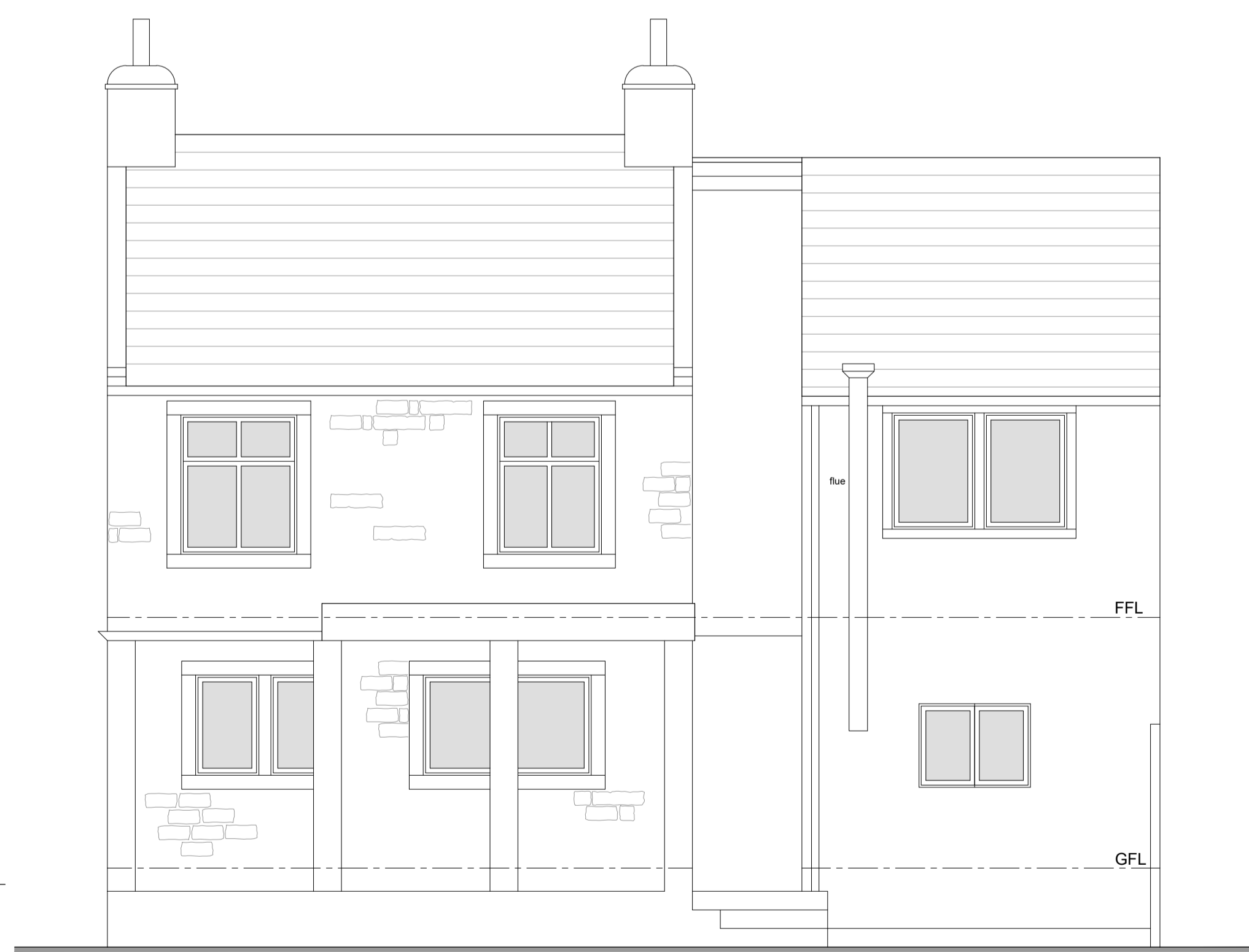
South Elevation (As Existing)