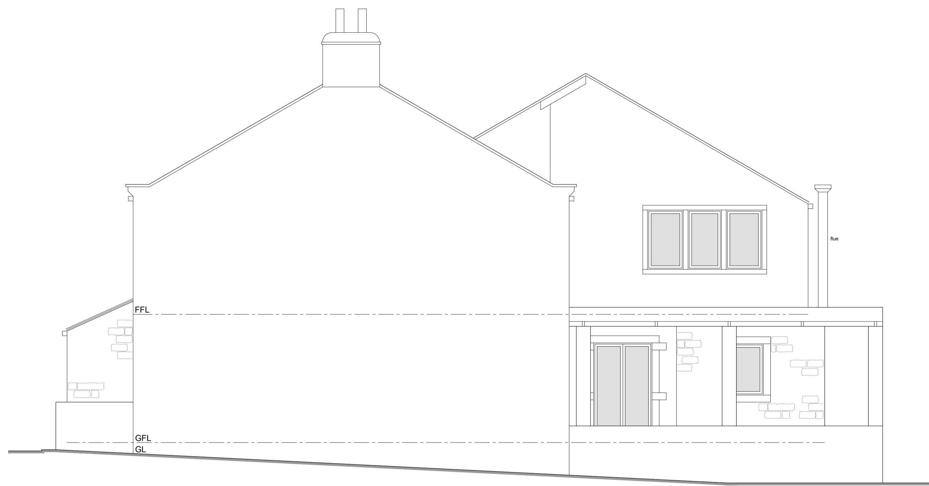
West Elevation (As Existing)