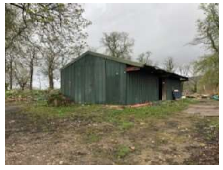
KL2950 - 'as existing' record of green metal shed to be removed