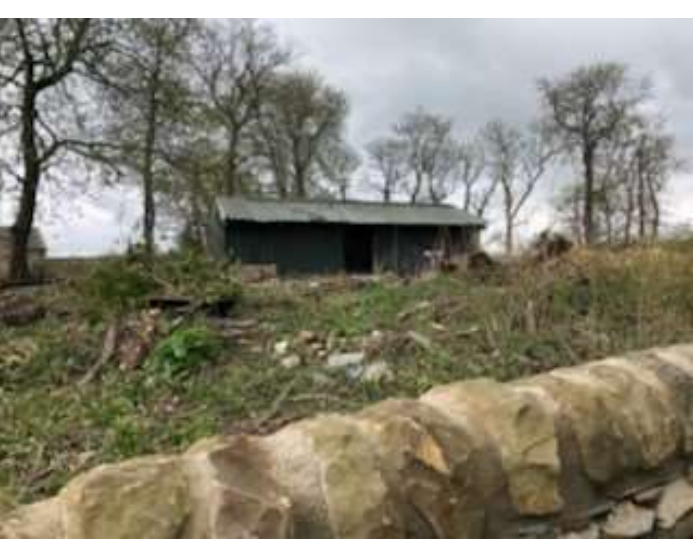
East elevation of shed from highway boundary