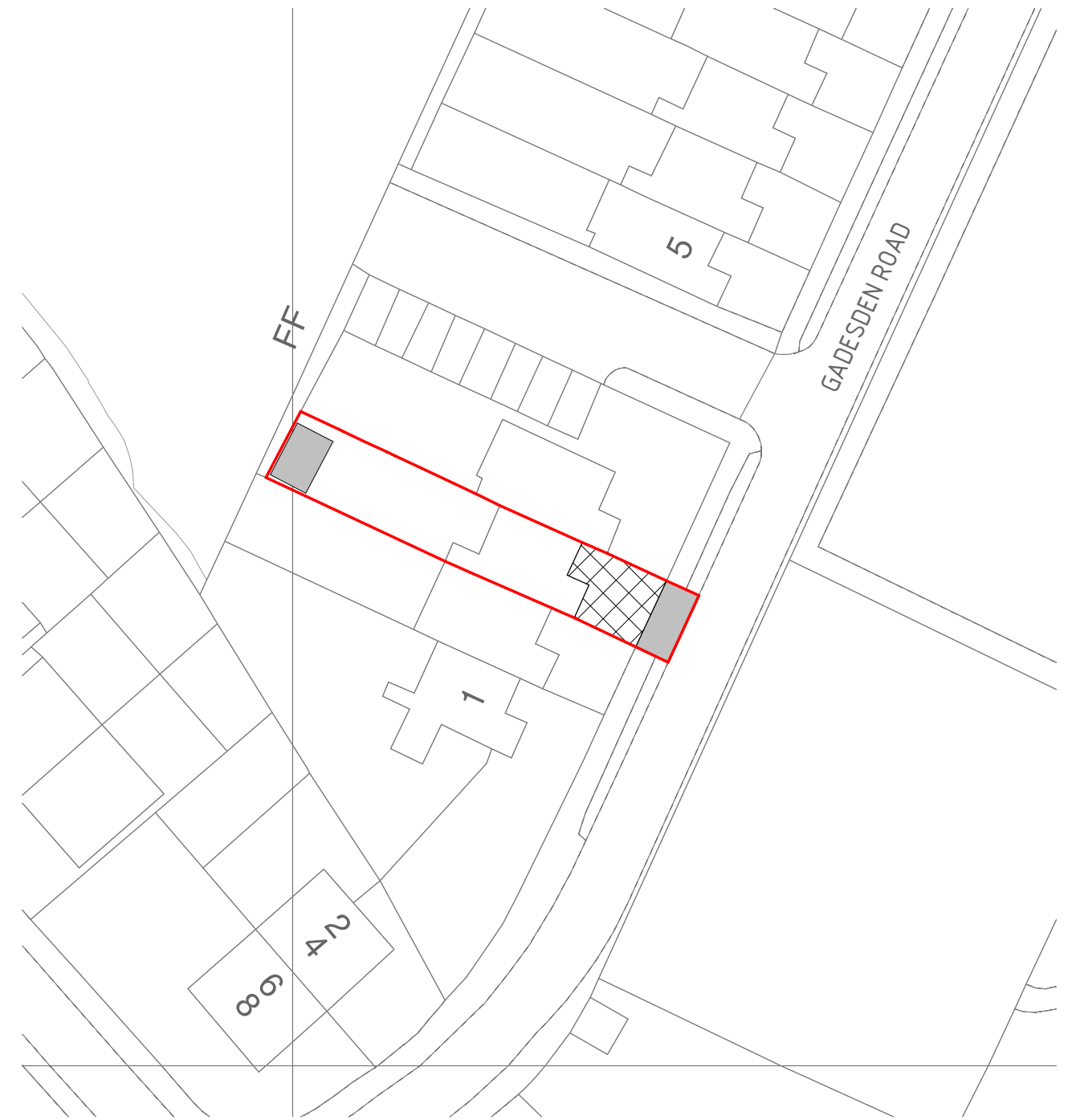
02/EBP - EXISTING BLOCK PLAN 1: 500