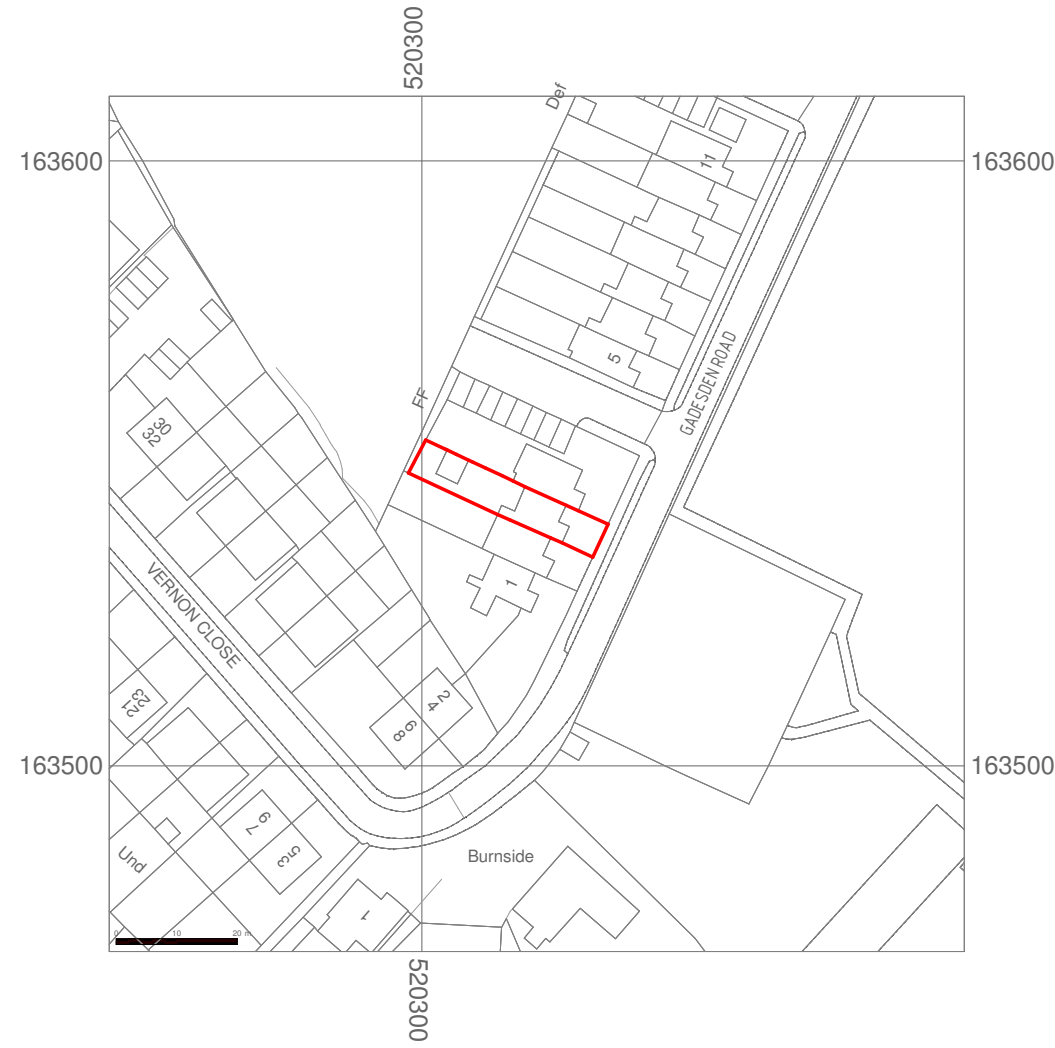
01/ELP - EXISTING LOCATION PLAN 1: 1250