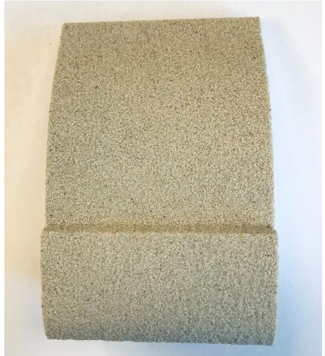
Image: Sytex Foamstone sample