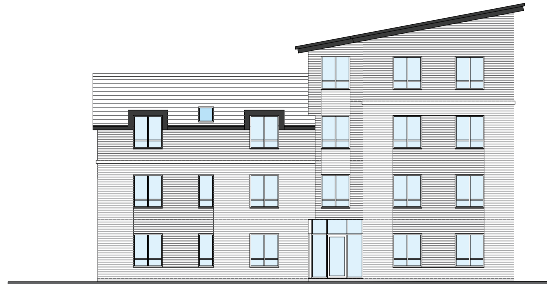
1:100 PROPOSED ELEVATION NORTH EAST FACING ELEVATION