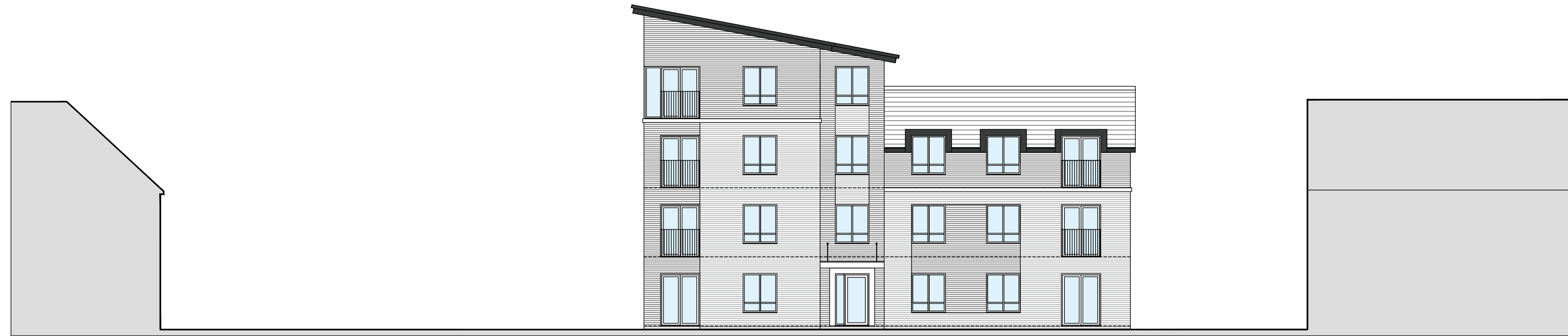
1:100 PROPOSED ELEVATION SOUTH WEST FACING ELEVATION