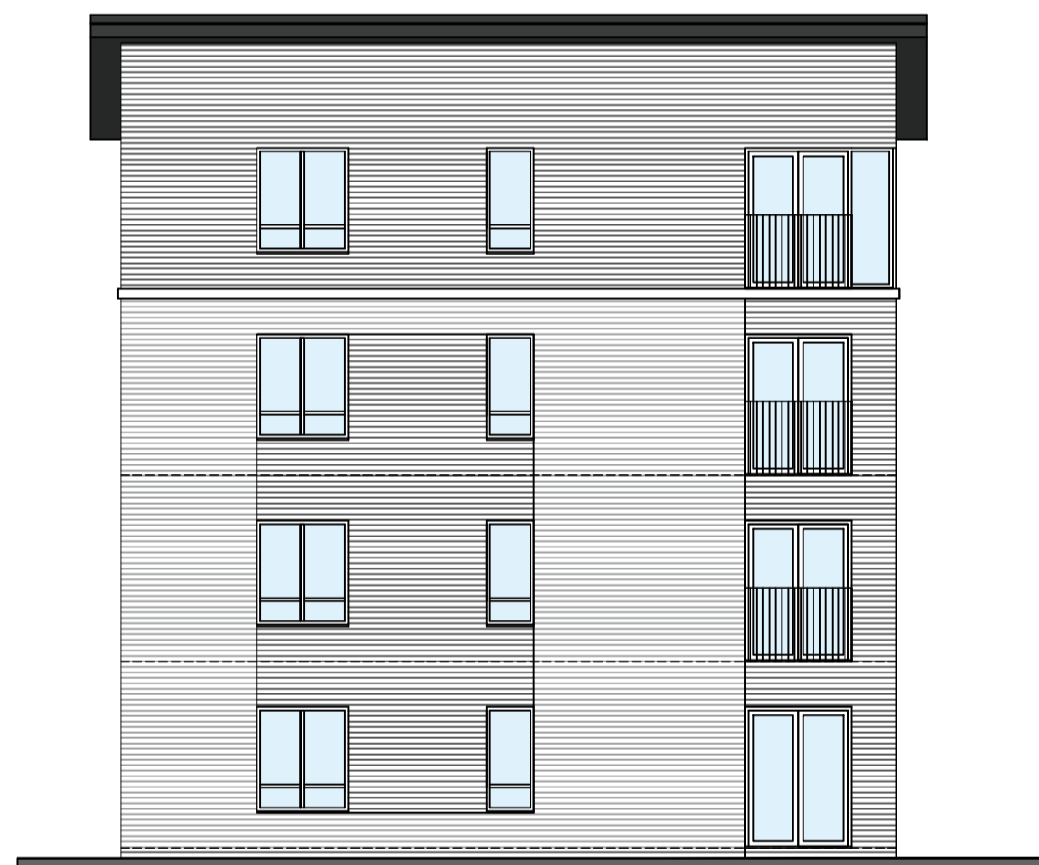
1:100 PROPOSED ELEVATION NORTH WEST FACING ELEVATION