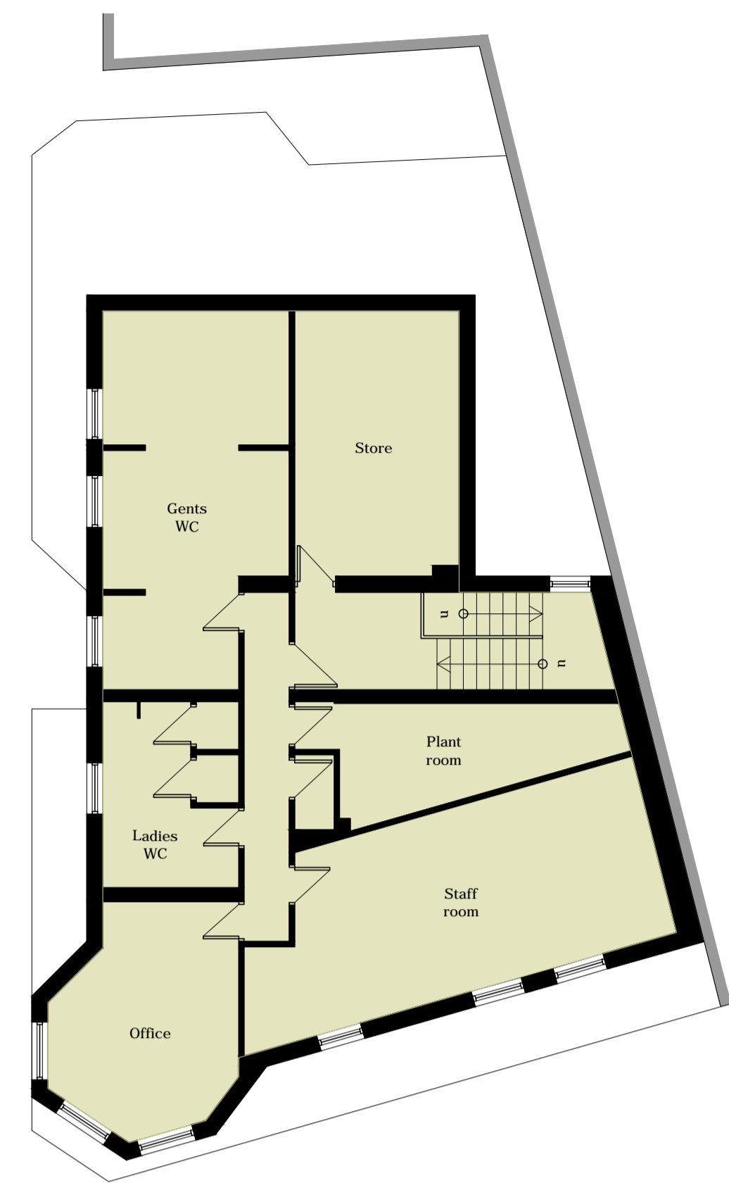
EXISTING SECOND FLOOR PLAN 1:100