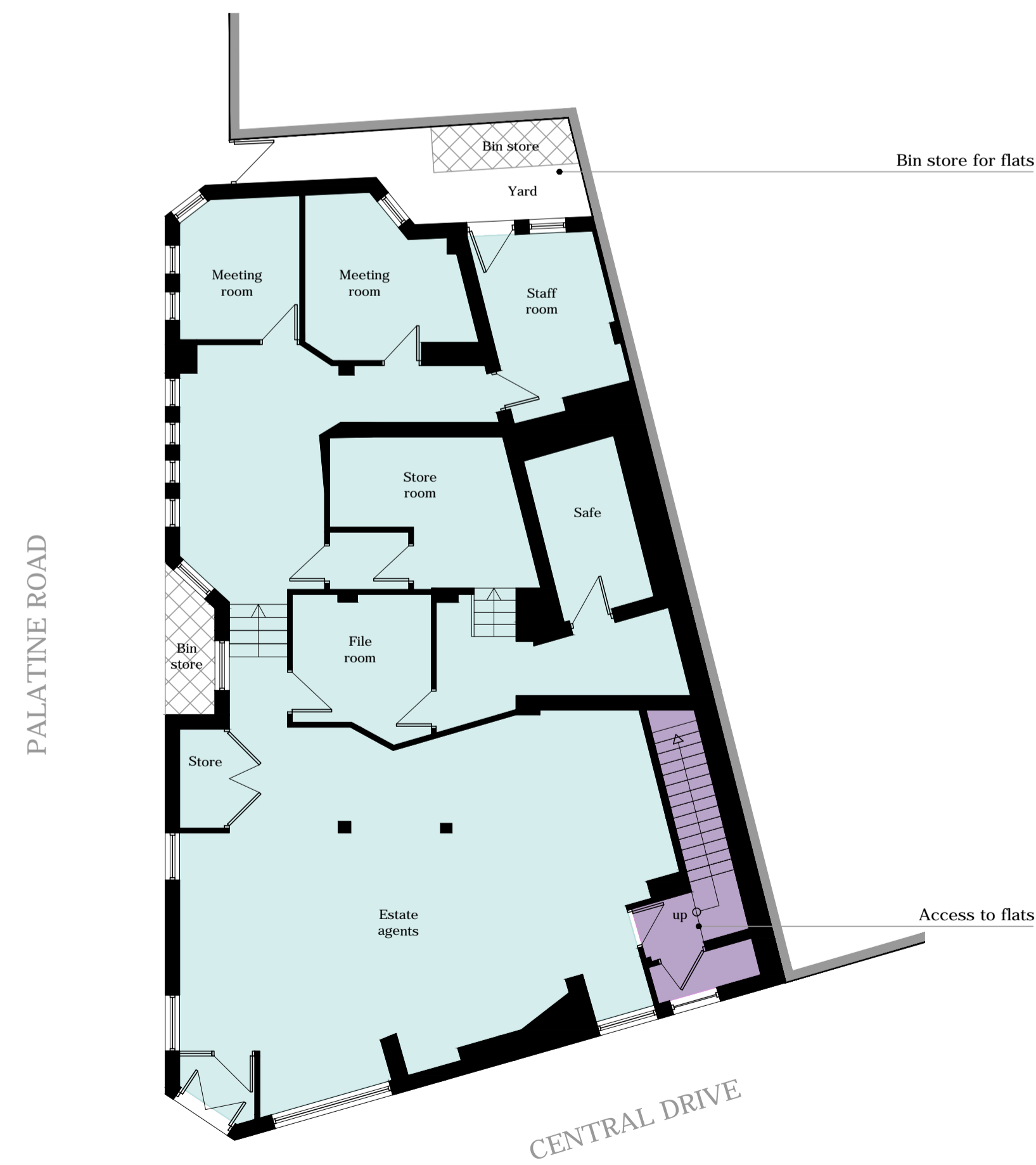
PROPOSED GROUND FLOOR PLAN 1:100