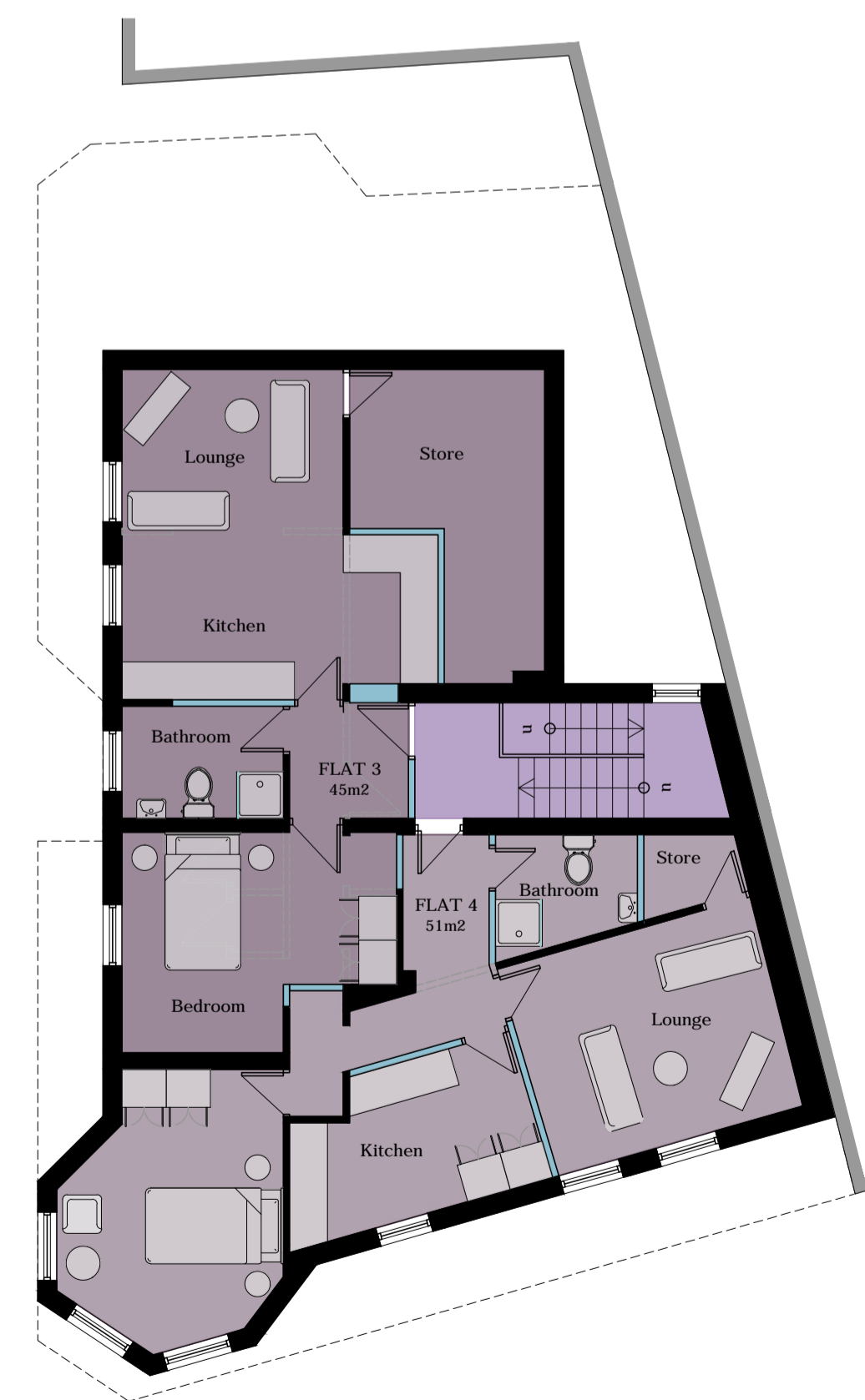
PROPOSED SECOND FLOOR PLAN 1:100