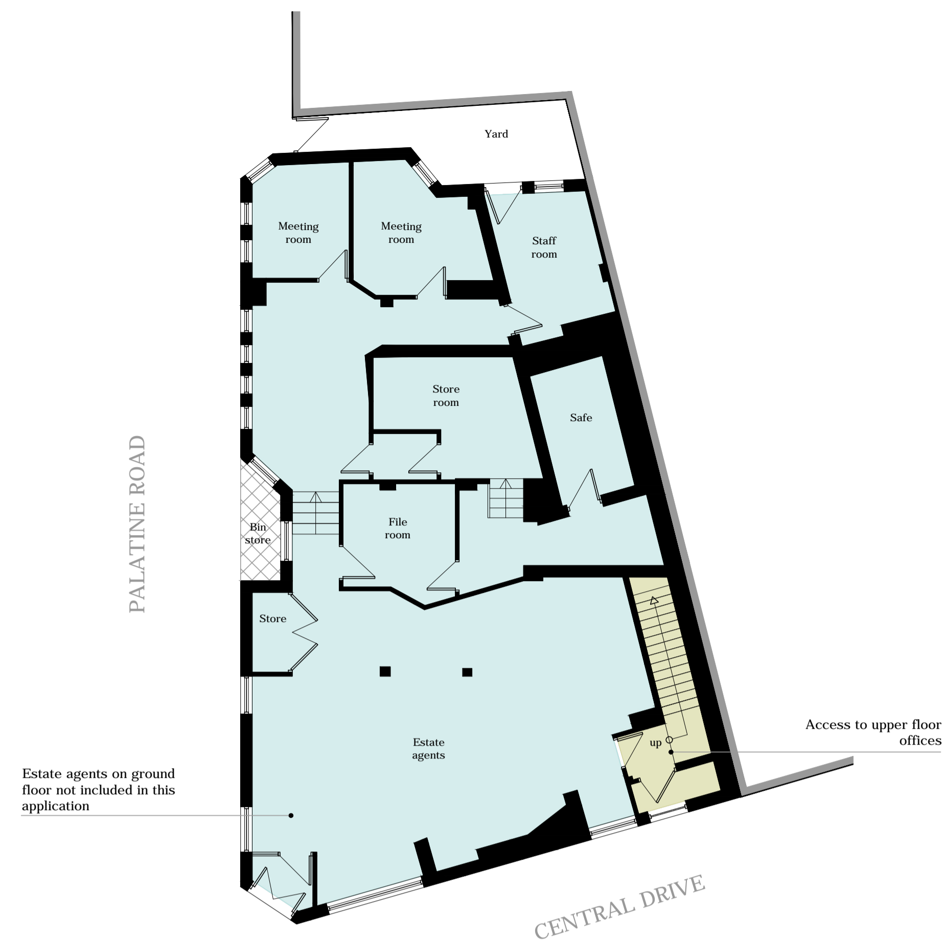
EXISTING GROUND FLOOR PLAN 1:100