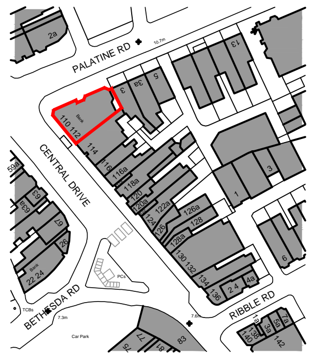
Site location plan 1:1250