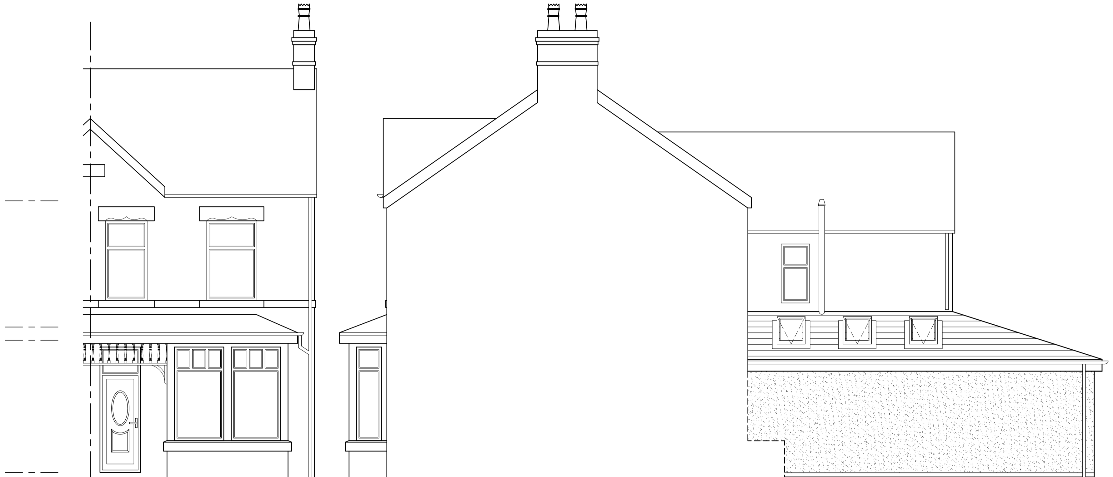
FRONT ELEVATION SIDE ELEVATION SCALE 1:50